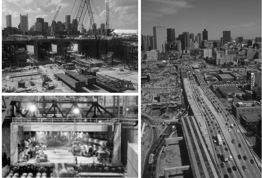
Figure 3: Boston's Central Artery/Tunnel Project