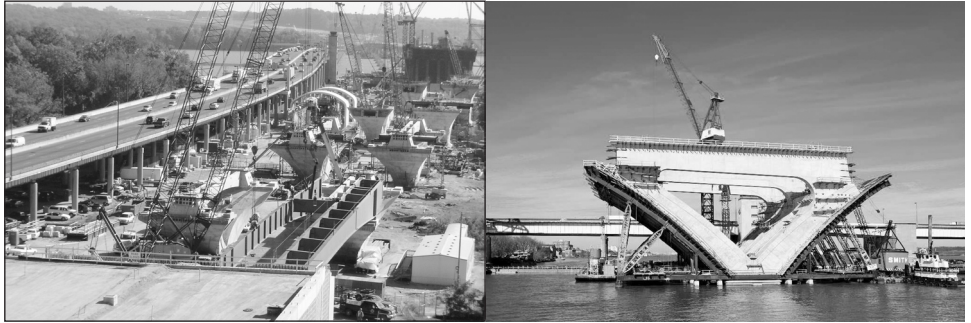
Figure 2: The Woodrow Wilson Bridge Project