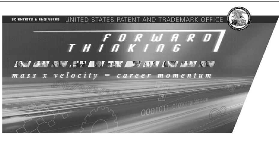
Figure 1: USPTO's 2004 Brand Image