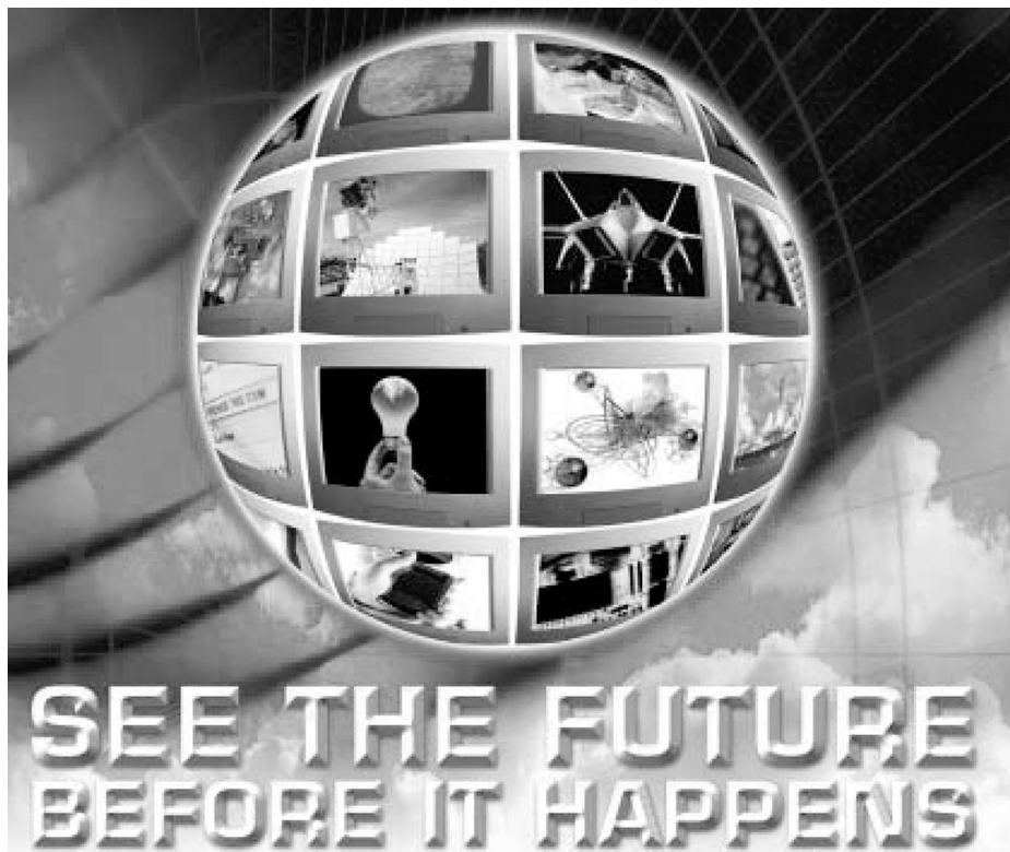
Figure 2: USPTO's 2002 Brand Image