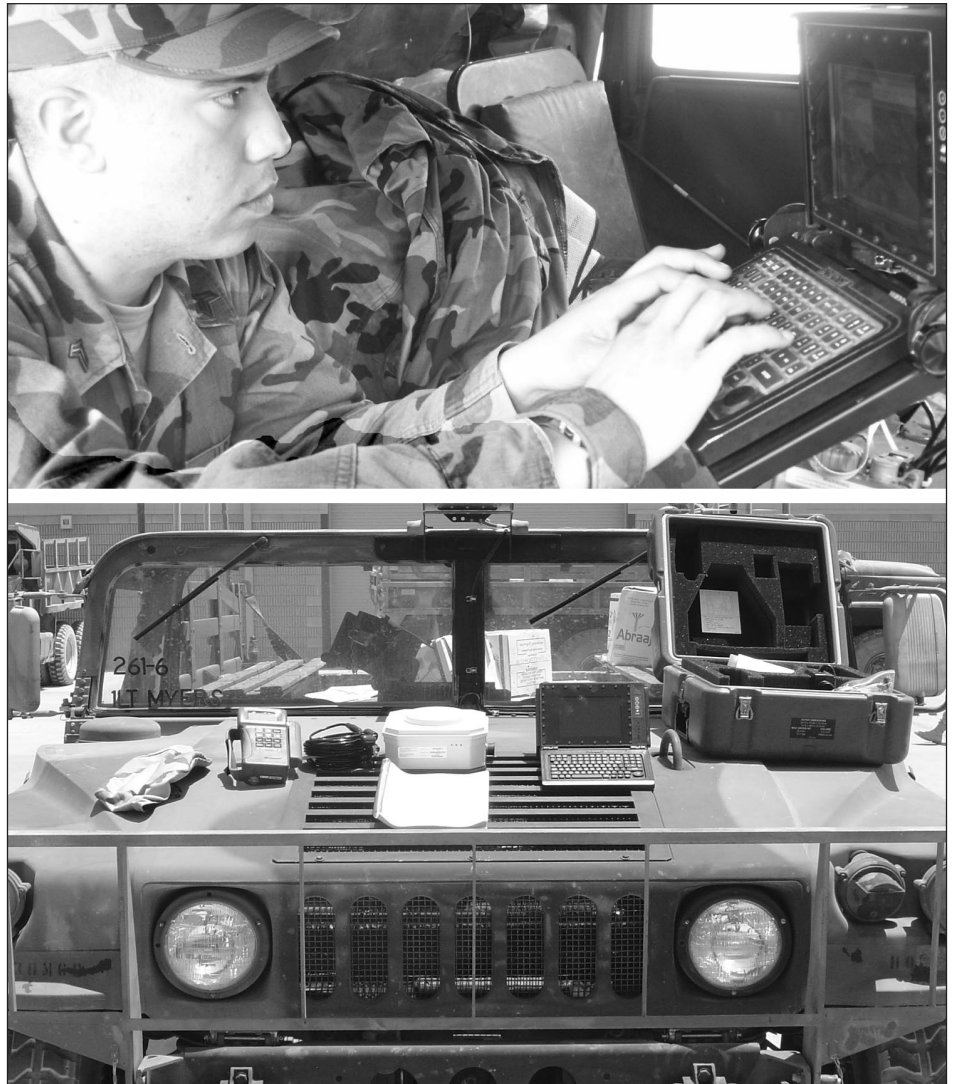
Figure 2: Mobile Tracking System