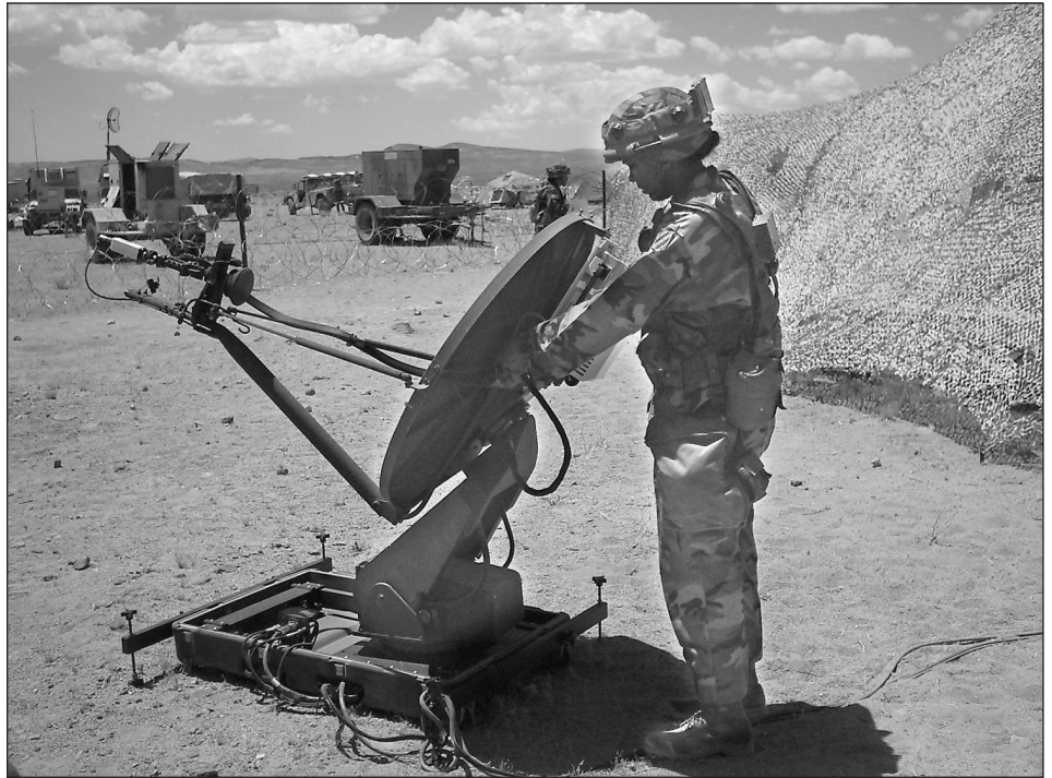
Figure 1: Very Small Aperture Terminal