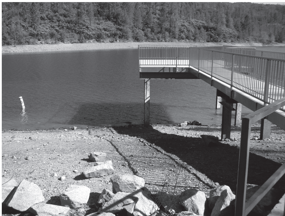
Figure 6: Fishing Pier at Whiskeytown National Recreation Area