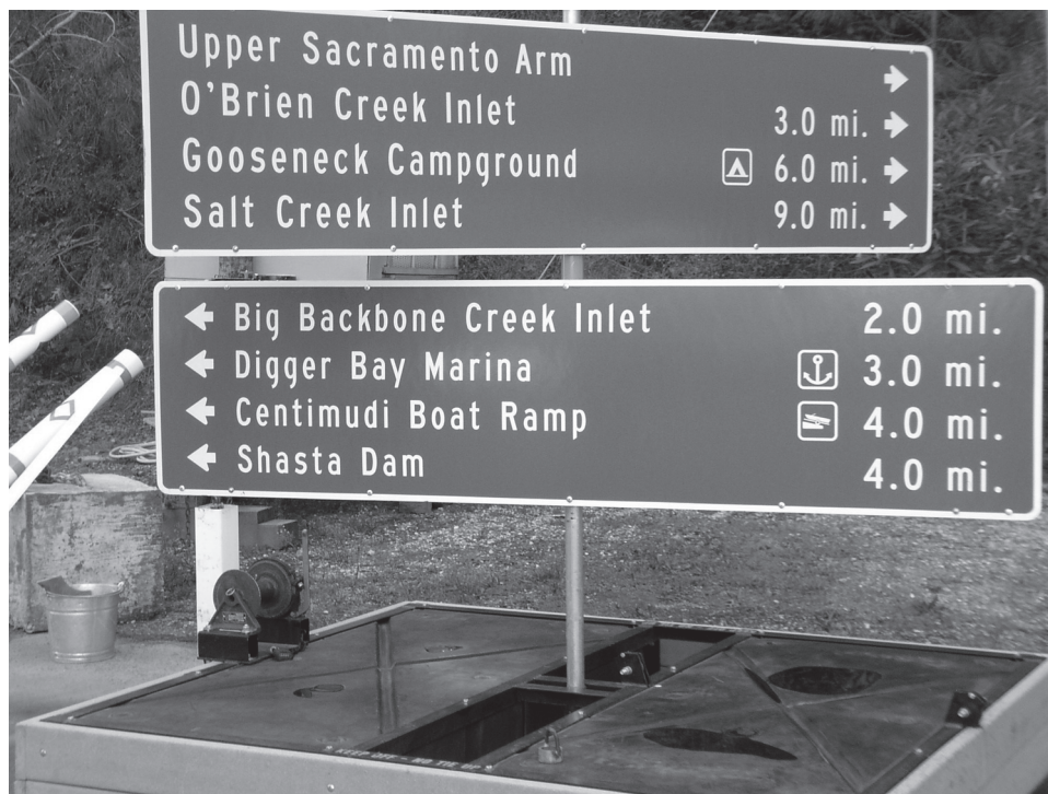
Figure 4: Lake Directional Sign Funded with Fee Revenues at the Shasta-Trinity National Forest