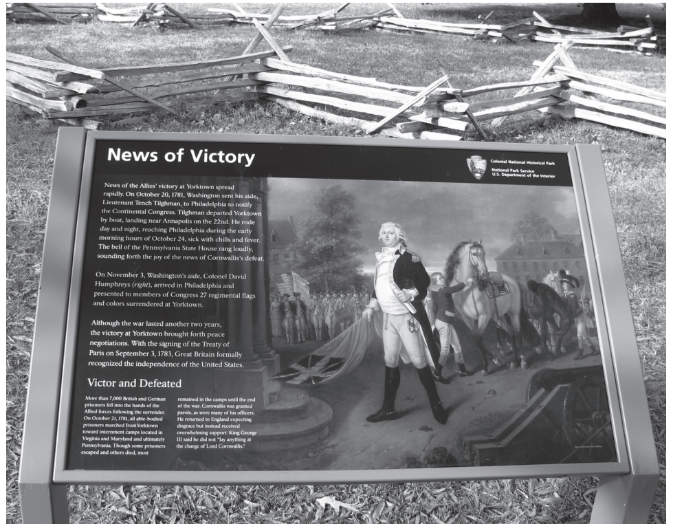
Figure 1: Interpretive Panel at Colonial National Historic Park