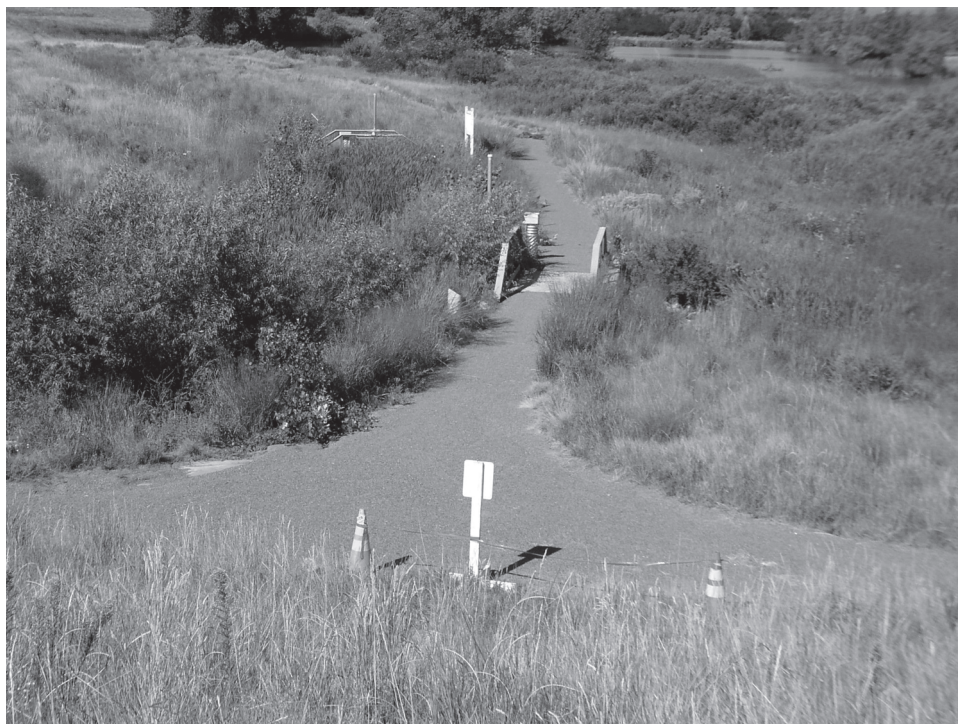
Figure 2: Site of Trail Work at Rocky Mountain Arsenal National Wildlife Refuge