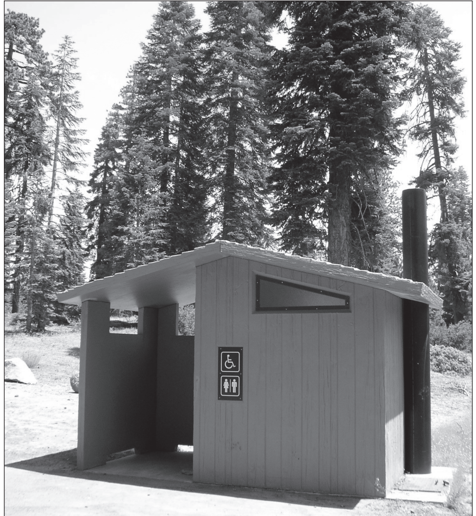
Figure 3: Restroom Constructed with Fee Revenue at the Big Meadows Winter Trailhead in Sequoia National Forest