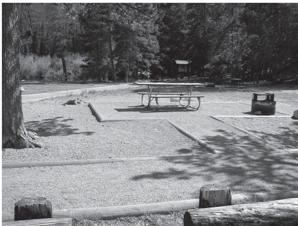
Figure 5: Campsite at Rocky Mountain National Park

tables, as can be seen in figure 5. These improvements enhanced visitor services by improving the level of amenities while also protecting natural resources by containing visitor impacts.