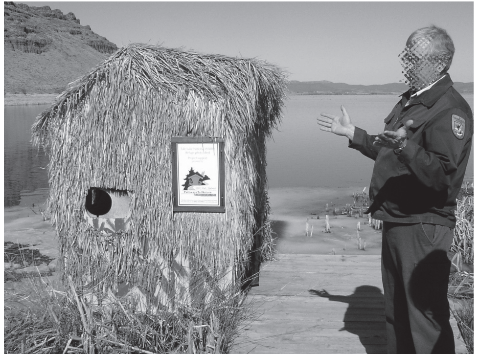
Figure 7: Photo Blind at Klamath Falls National Wildlife Refuge Complex