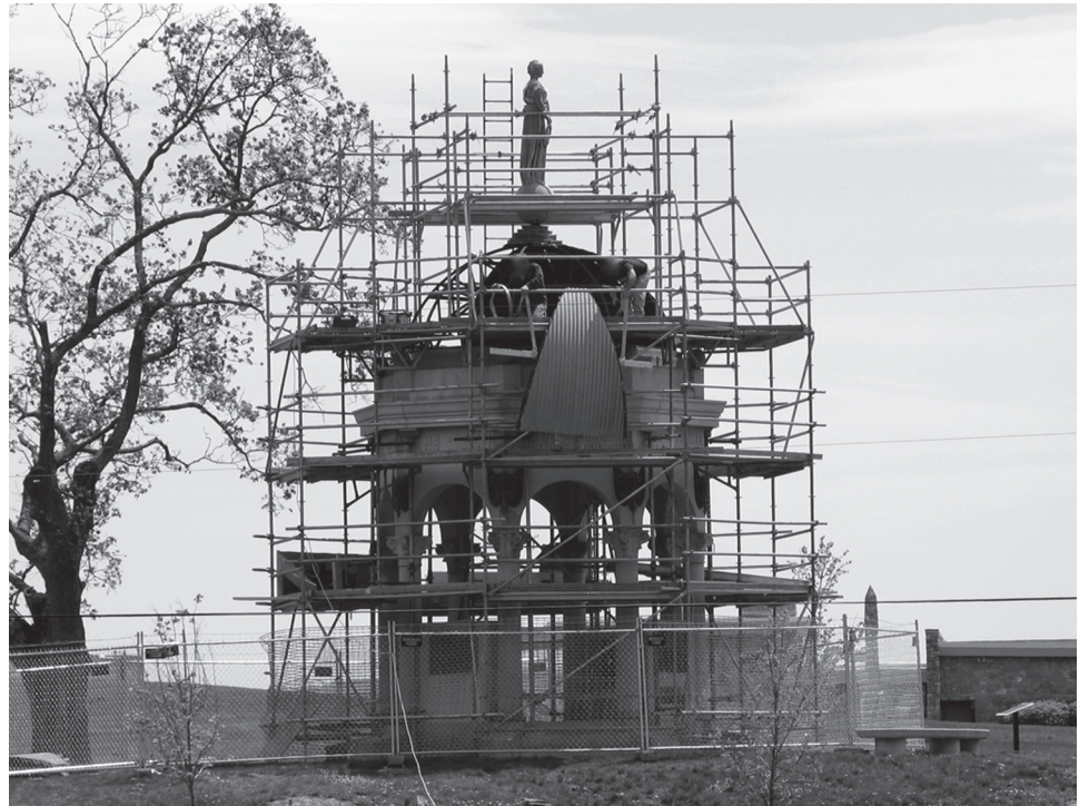
Figure 8: Monument at Antietam National Battlefield