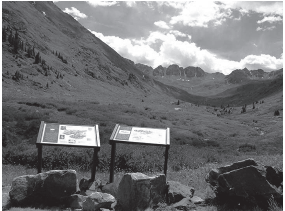
Figure 9: Interpretive Panels at American Basin