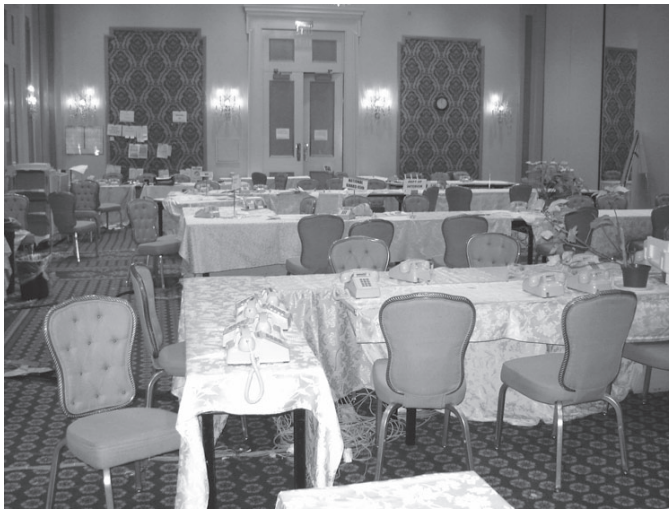
Figure 1. Hotel Conference Room Where FEMA Laptops and Printers Were Supposed to Be