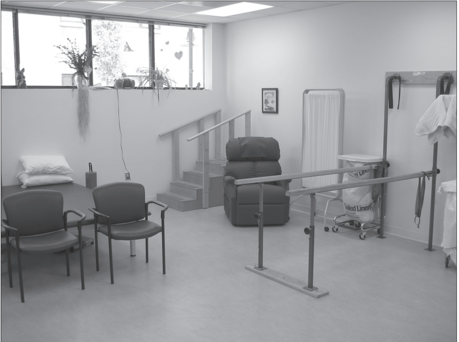
Figure 12: Physical Therapy Area at the Community LIFE Center