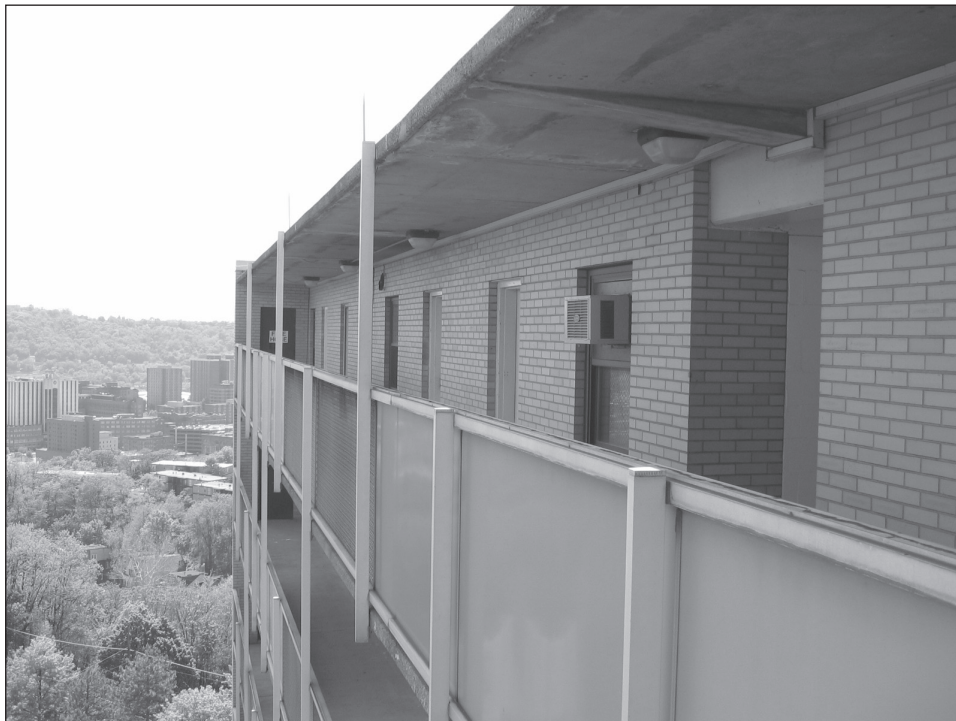
Figure 5: Inadequate Shelter, Such as Exterior Walkways at a High-Rise Development, Exposes Residents to the Elements