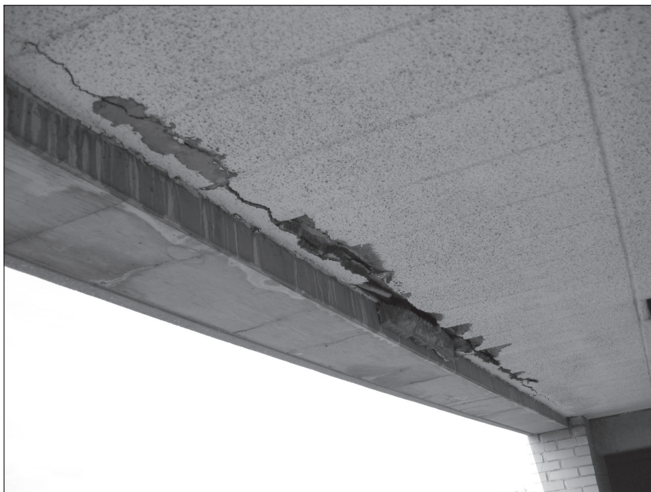
Figure 4: Signs of Severe Physical Distress Include Deteriorating Infrastructure Such as Concrete Surfaces

spoke with said that high-rise buildings limit social interactions among elderly residents.