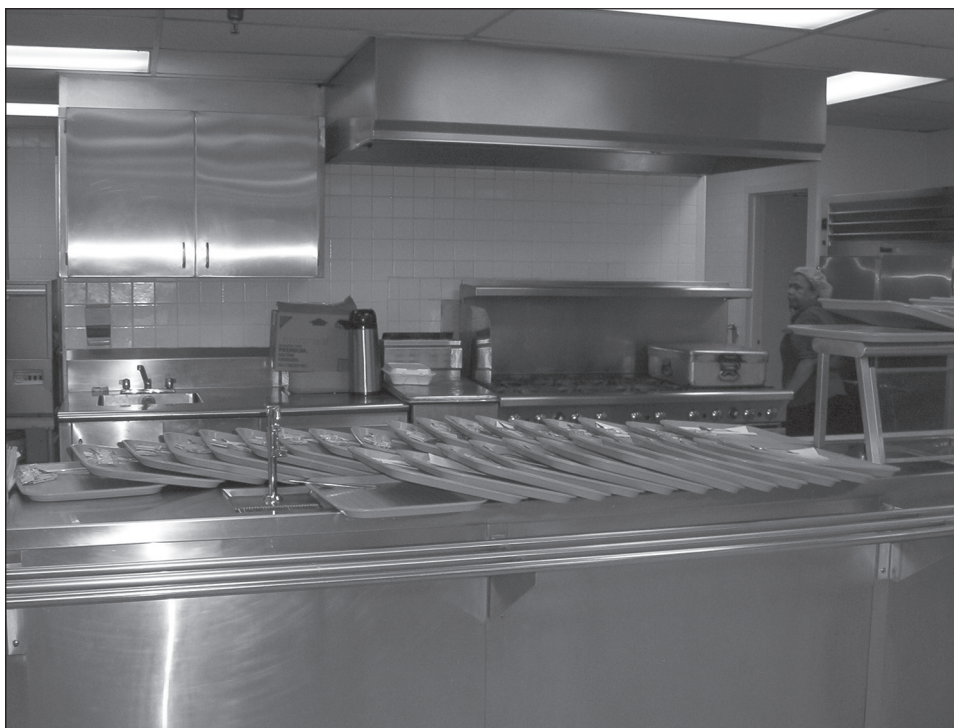
Figure 13: Commercial Kitchen Space at Helen Sawyer Plaza