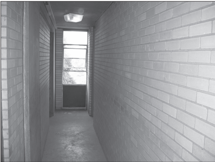
Figure 7: Examples of Lack of Access for the Elderly and Persons with Disabilities Include Narrow Hallways and Elevators That Cannot Easily Accommodate Wheelchairs or Scooters

to one housing development, the building manager told us that none of the apartment units were accessible to persons with disabilities; therefore, prospective residents with special needs were referred to another building within the housing agency's portfolio.