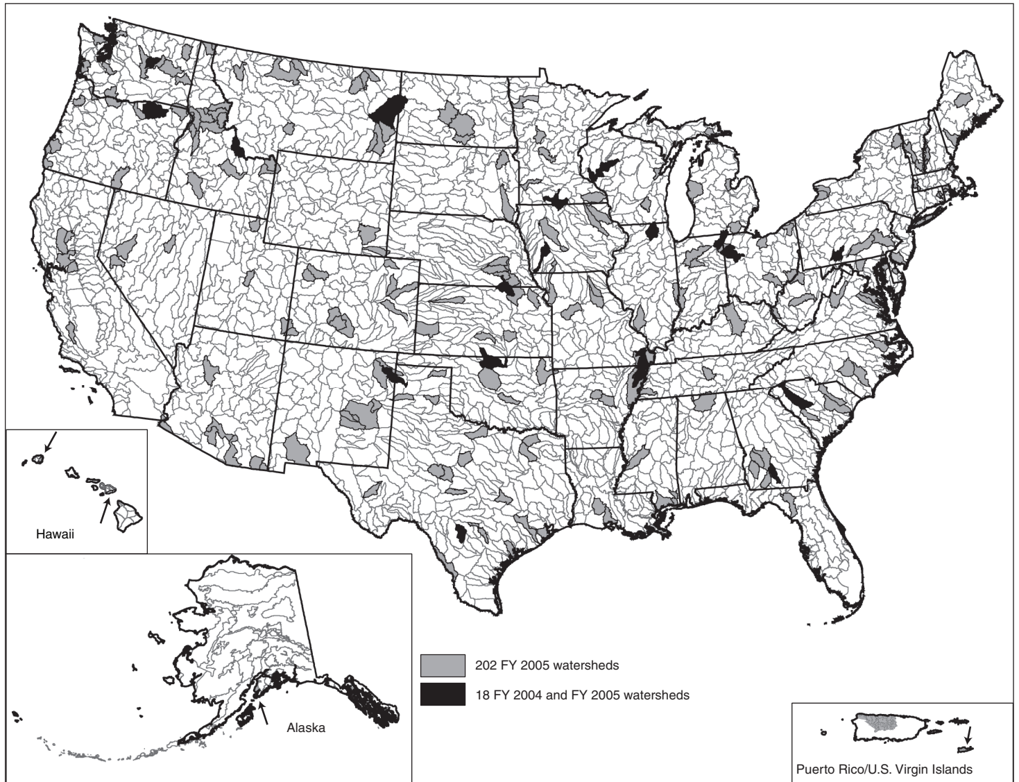
Figure 1: Watersheds Included in the Fiscal Year 2004 and Fiscal Year 2005 CSP Sign-ups