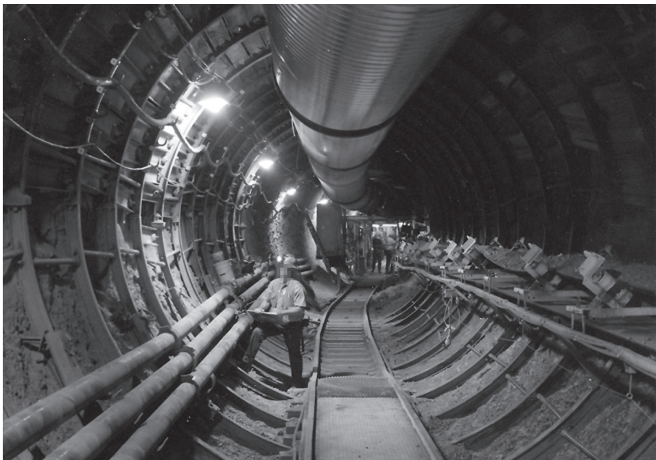
Figure 2: The 1.7-Mile Tunnel Built for Scientific Studies near the Potential Repository Area