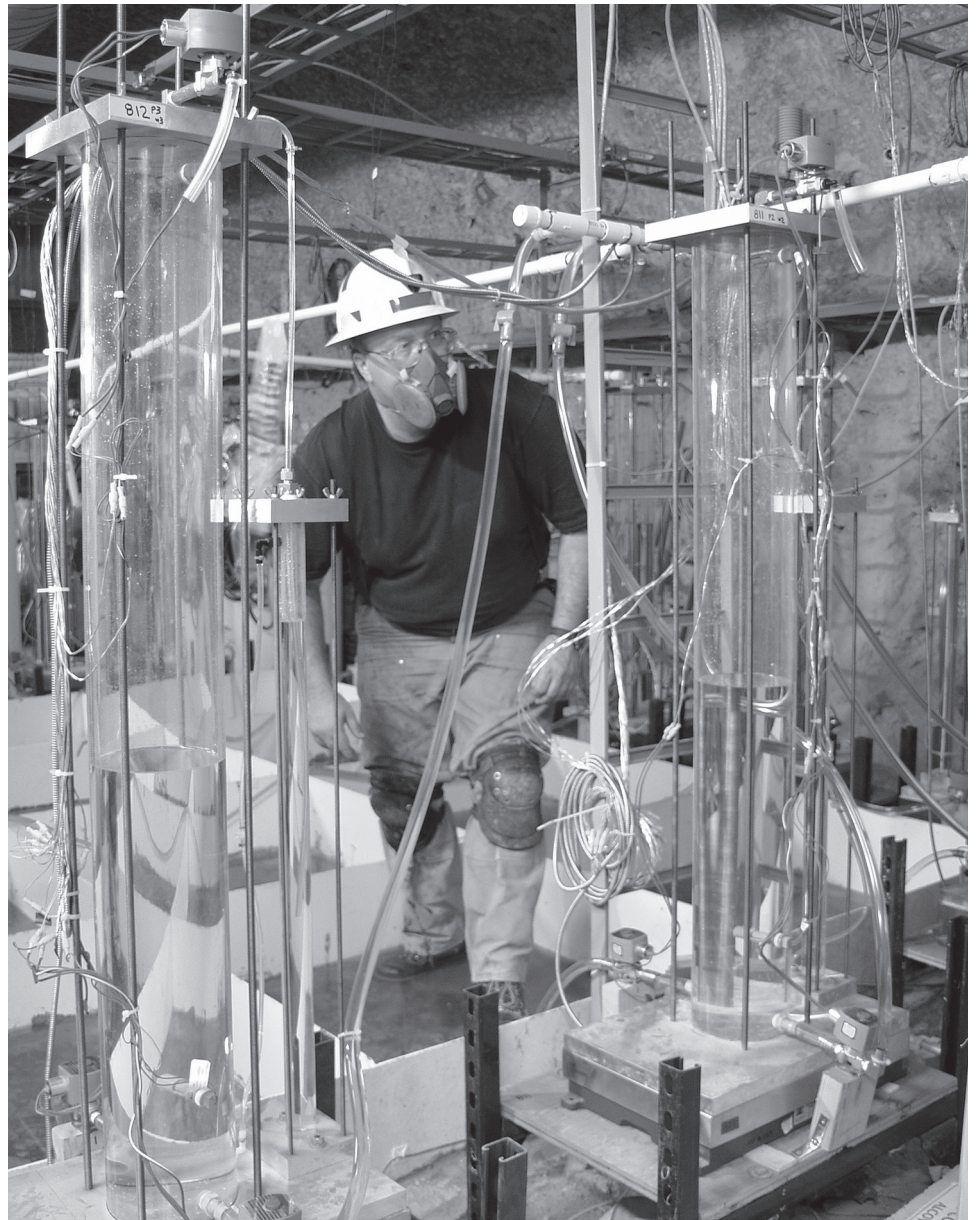
Figure 1: A Yucca Mountain Project Scientist Conducts Water Infiltration Tests inside Yucca Mountain