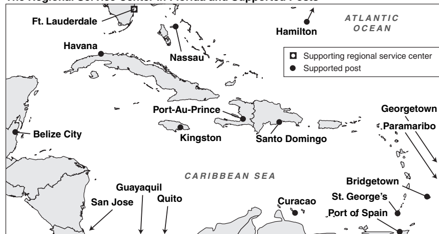
The Regional Service Center in Florida and Supported Posts

There are several potential advantages to providing administrative support to posts from remote locations, and several concerns. For example, one U.S.-based officer provides financial management support to multiple overseas posts, eliminating the need for an American financial management officer at each post served, which, according to State, could result in cost savings. Officials at posts we visited reported they were generally satisfied with the level of support and customer service at a regional or domestic service center, though some noted concerns. However, at the time of our review, State had neither analyzed the potential cost savings associated with providing remote support nor systematically assessed the quality of support provided. In addition, many officials in Washington and overseas were unaware of the full breadth of support offered by regional service centers.