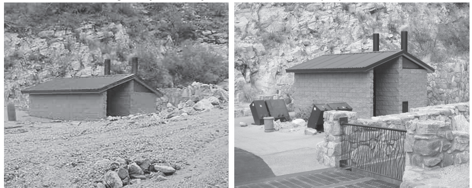
Forest Service Building Partly Buried by Postfire Flood Debris (left) and Restored Later

Forest Service and BLM officials face different challenges to addressing their rehabilitation and restoration needs. Forest Service officials cited factors such as competing priorities within constrained budgets and controversy over certain activities. Agency officials said that controversy over harvesting burned timber can be exacerbated by the limited scientific research available to guide such decisions. BLM officials cited challenges to achieving long-term success when seeding burned areas. The agency is taking several steps to improve success rates.