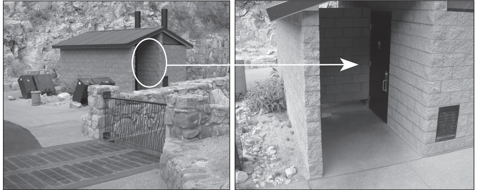
Figure 2: Completed Rehabilitation of Sabino Canyon Recreation Site, Coronado National Forest, Arizona