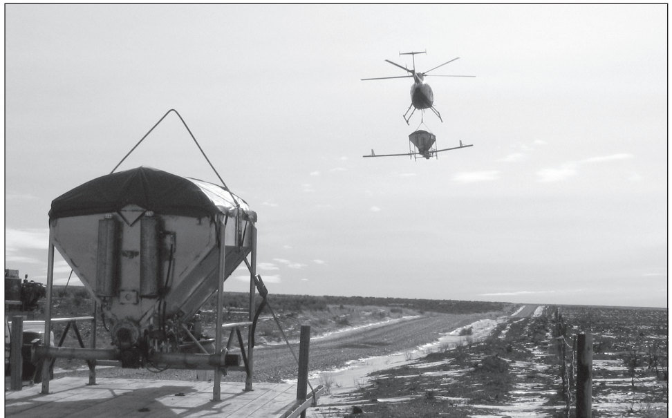
Figure 3: A Helicopter Prepares to Aerially Seed a Burned Area after a 2005 BLM Fire

following select Idaho fires was “not a reliable, effective seeding method,” at least in the sites studied. Sagebrush shrubs were not established on 23 of the 35 projects in the study. 19