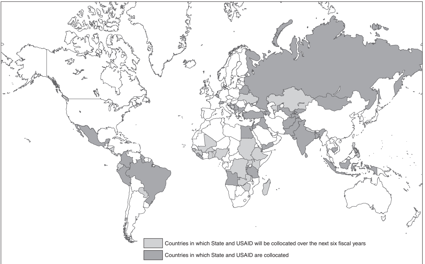
Figure 1: Posts Where State and USAID are Collocated or Will be Collocated Based on Current Construction and USAID Deployment Plans, Fiscal Years 2006-2011