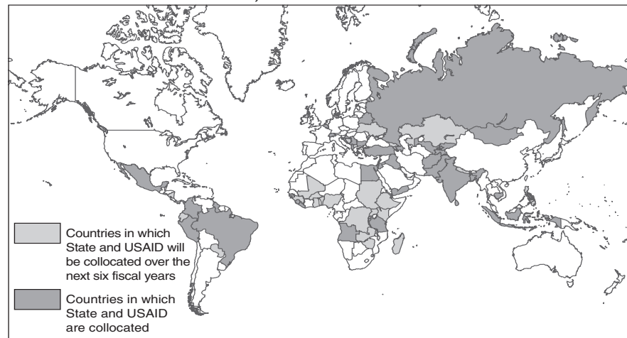
State and USAID Collocated Posts, Fiscal Years 2006-2011

The two agencies face several challenges in consolidating services at posts. The challenges include the need for State and USAID in Washington and at posts to address concerns that USAID's costs may increase if services are consolidated, develop better cost and performance data, reduce the number of locally employed staff and reduce or replace U.S. direct hires with locally employed staff, communicate better, and resolve technical differences. During our work, State and USAID took steps to address some of these challenges. For instance, in June 2006, the two agencies produced a draft strategy that defines broad goals and sets forth a common vision—to combine at collocating posts all State and USAID services into a single administrative structure and reduce the number of U.S. direct hire personnel. This is a positive step. However, our analysis of the draft strategy shows that it does not include a plan that details milestones, specific goals, timelines, and performance measures or accountability mechanisms to demonstrate results.