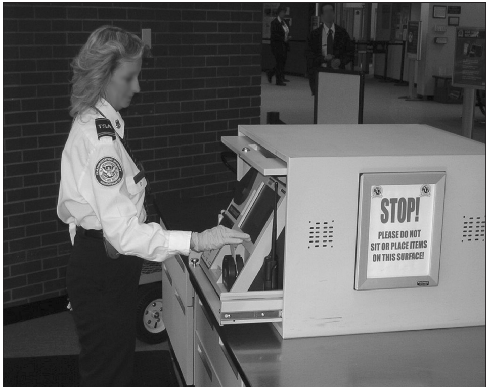
Figure 2: ETD Machine Used by TSA to Screen Checked Baggage