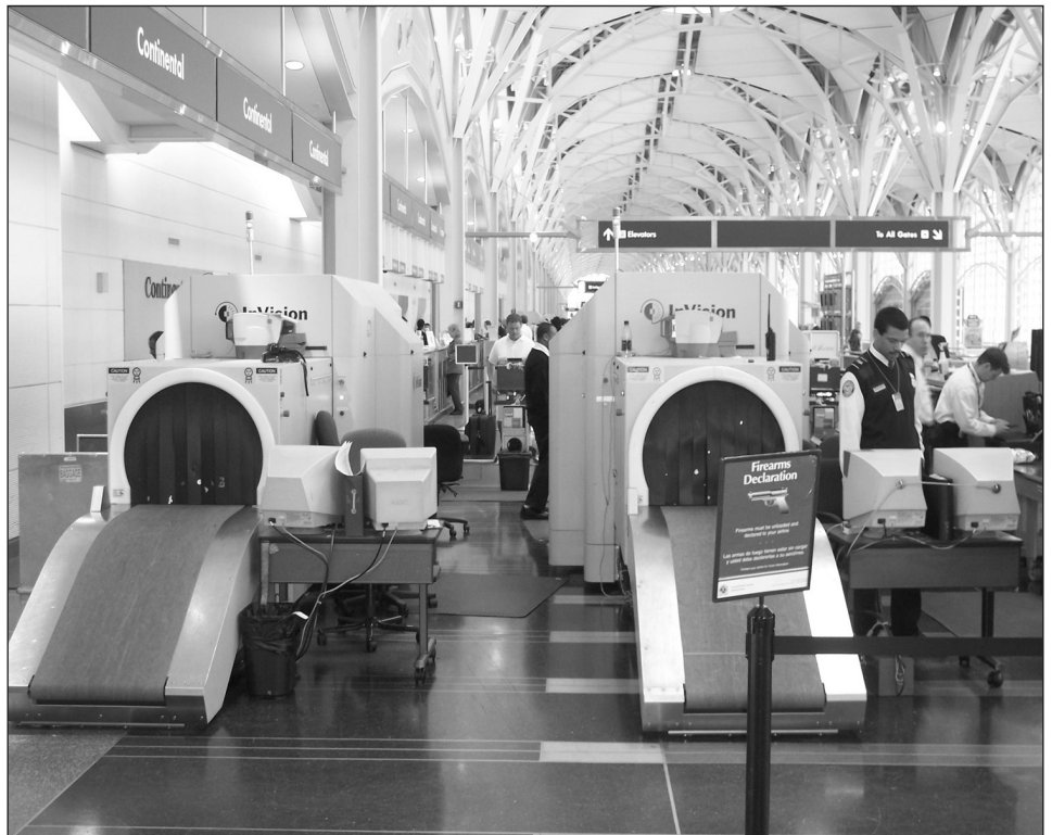
Figure 1: EDS Machines In a Stand-alone Configuration Used by TSA to Screen Checked Baggage