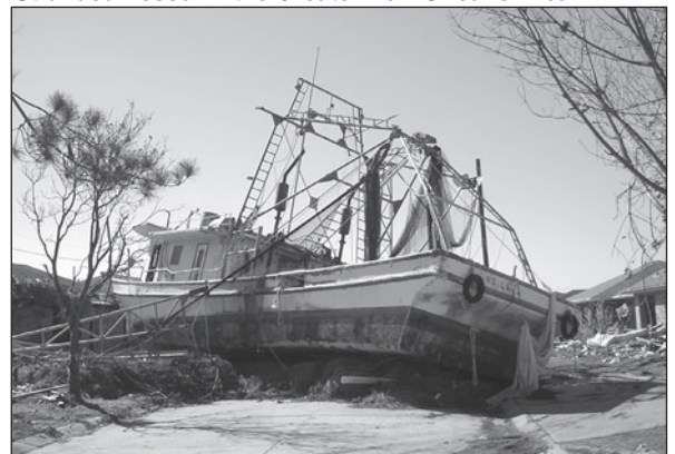
Stranded Vessel in the Greater New Orleans Area