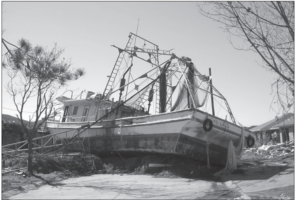
Figure 5: Stranded Vessel in the Greater New Orleans Area