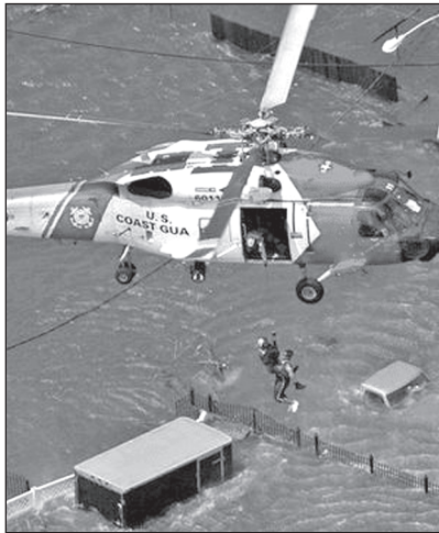
Figure 4: Helicopter Rescue in Response to Hurricane Katrina