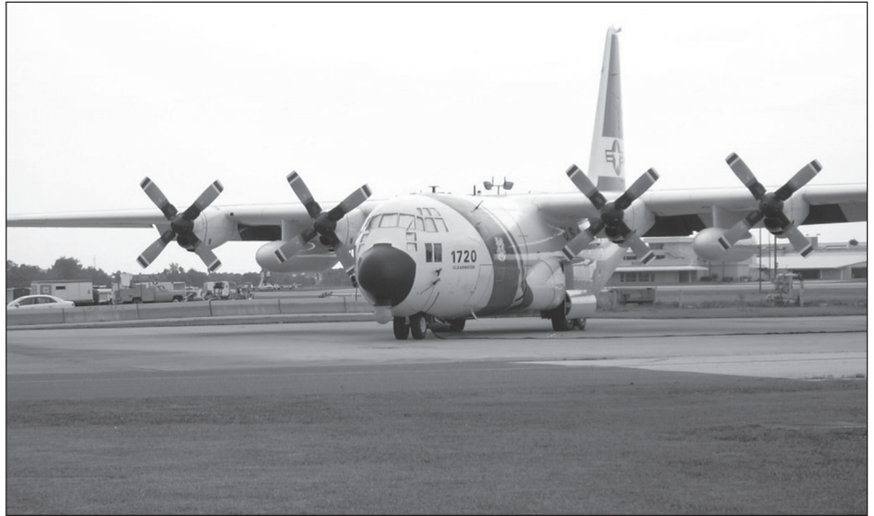
Figure 1: Coast Guard C-130 Aircraft Used as a Communication Platform, Also the Type of Aircraft Used to Transport Food, Water, and Supplies to the Gulf Coast Region