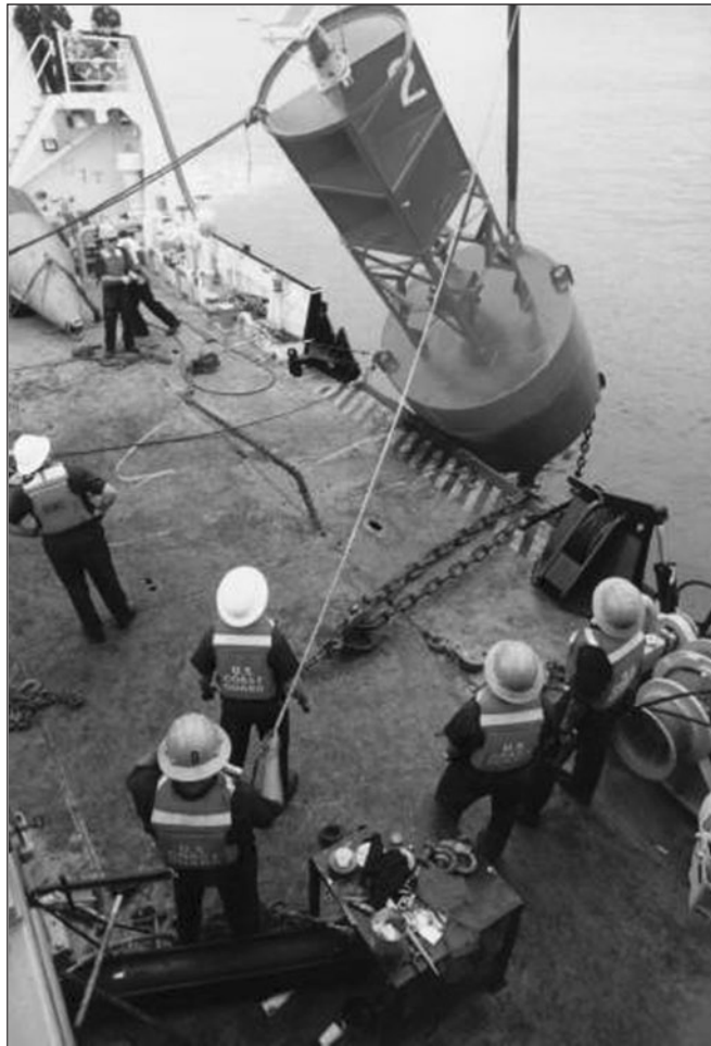
Figure 6: Coast Guard Personnel Servicing Aids to Navigation