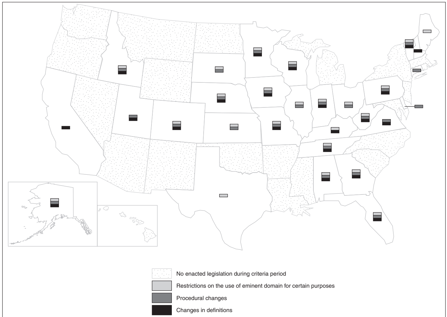
Figure 3: Changes to State Eminent Domain Laws from June 23, 2005, through July 31, 2006

Sources: GAO (analysis); Art Explosion (map).