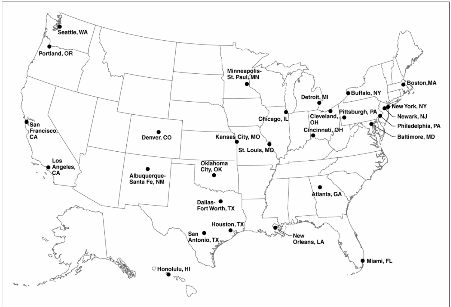
Figure 1: Location of the 28 FEBs

Sources: GAO analysis based on OPM data and Map Resources (map).