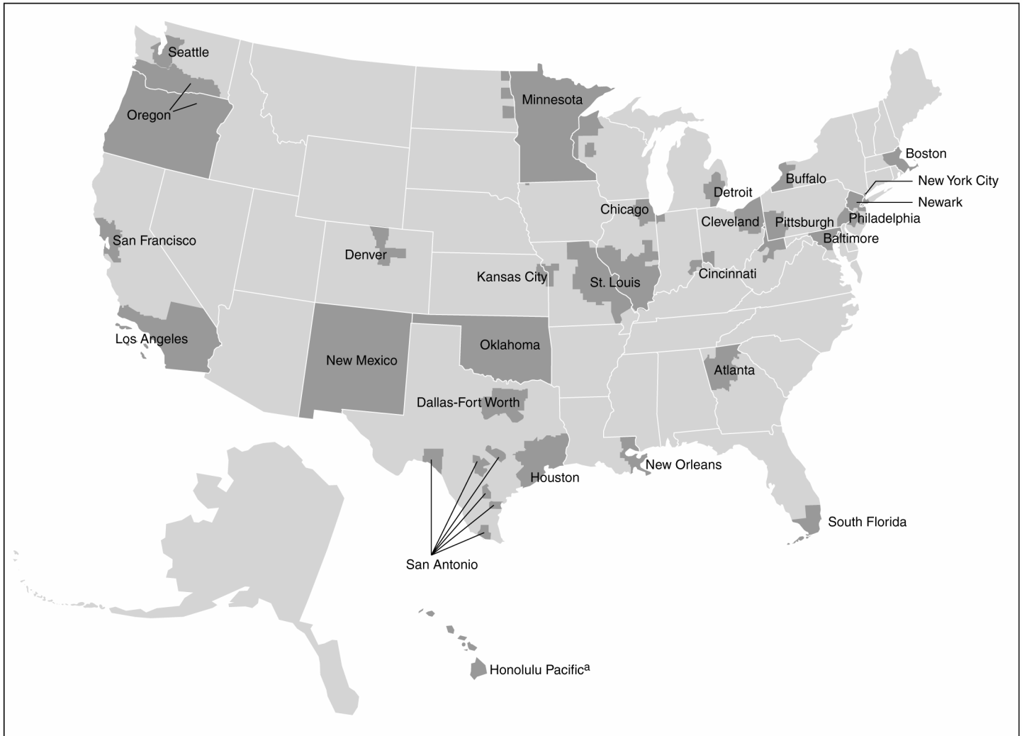
Figure 2: Jurisdictional Boundaries of the 28 FEBs