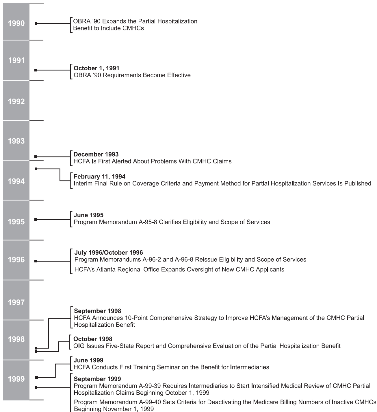
Figure 2: Key Activities and Actions Related to the Partial Hospitalization Benefit