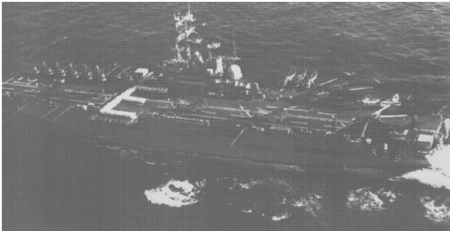
Figure 1.3: The U.S.S. Inchon

To provide command and control functions, serve as a platform for helicopters, and support supply and logistics operations, the Navy Mine Warfare Command began converting the helicopter landing ship U.S.S. Inchon to an MCS ship in March 1995. When this conversion is completed in about March 1996, at a cost of more than $118 million, the U.S.S. Inchon will be capable of carrying an MCM Group Commander and staff and supporting long-endurance airborne, surface, and underwater MCM operations. (See fig. 1.3.) The U.S.S. Inchon , which is 25 years old, has an expected lifespan of about 10 more years. The Navy has tentative plans to design and build a new MCS ship early in the next century.