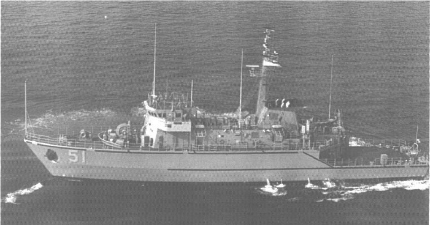
Figure 1.2: An MHC Ship