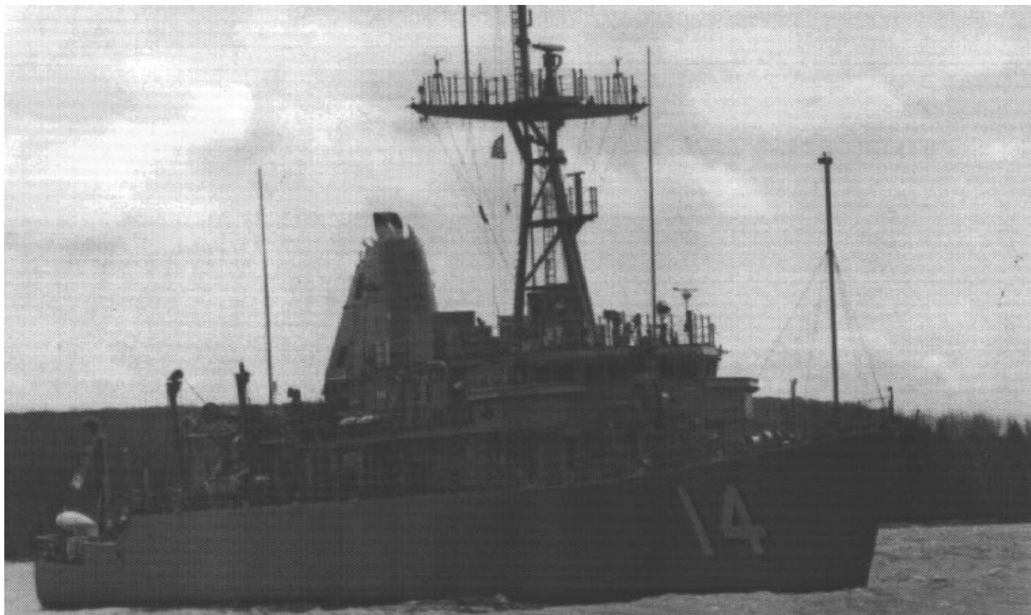
Figure 1.1: An MCM Ship

The Avenger class MCM ship, the larger and more capable of the two classes of mine countermeasures ships, is a 224-foot ocean-going mine warfare ship designed to clear mines in both coastal and offshore areas. (See fig. 1.1.) The hull is constructed of wood and glass-reinforced plastic to maintain a nonmagnetic character, which is essential to mine clearing operations.