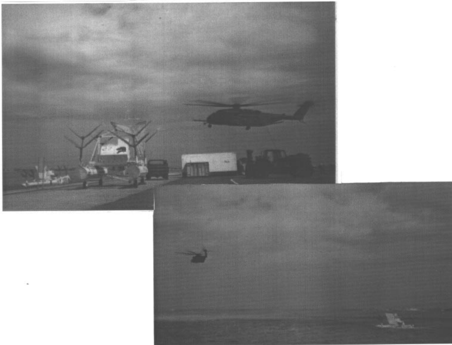
Figure 1.4: An MH-53E Helicopter With Minesweeping Gear