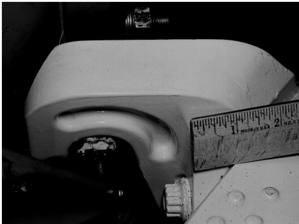
Figure 2: Hook