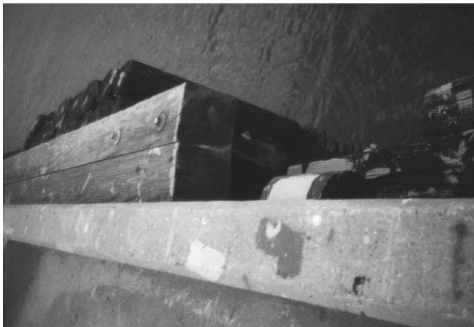
Figure 4: Portion of Aging Pier Structure at Norfolk Naval Station, Virginia

The Marine Corps' Cherry Point and Camp Lejeune, North Carolina, installations appeared in good condition. However, Marine Corps headquarters officials said bases on the West Coast, such as Camp Pendleton and Camp Barstow, California, were in worse condition. The officials attribute the poor condition of these bases to a large inventory of World War II-era wood facilities, strict State of California environmental oversight, and high contract and labor costs.