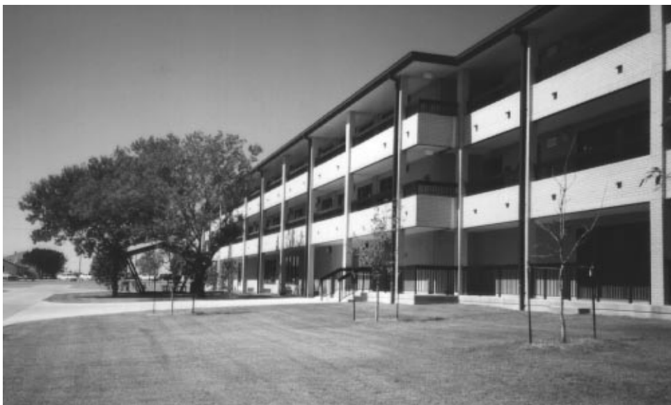
Figure 3: New Army Barracks at Fort Hood, Texas

At the installations we visited, facilities were in various states of maintenance and repair. For example, at Fort Hood, Texas, new barracks construction and renovation were taking place (see fig. 3), and facilities overall appeared to be in much better condition than at Fort Eustis, Virginia, where less new construction has occurred. However, officials at both installations cited growing backlogs in maintenance and repair in other base facility areas, such as sewer and water systems.