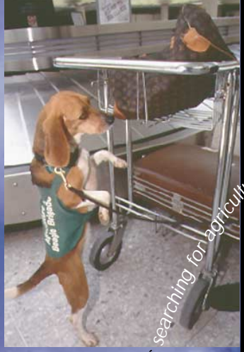
searching for agricultural

APHIS uses detector dogs to augment its force of officers and x-ray machines