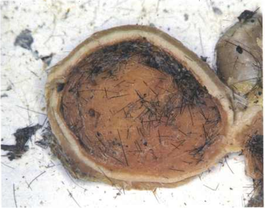
Figure 4.—Cuckoo stomach.

Animal and Plant Health Inspection Service field crew collected within a 52-ha area approximately 8,000 female sixth-instar larvae, prepupae, and pupae almost exclusively from small mammal tunnels located at the base of oak trees. Few pupae were found anywhere else. This behavior of resting and pupating in small mammal tunnels is not unique and has been observed in our study area in Connecticut, but the fact that gypsy moths used these tunnels almost exclusively at pupation locations seemed unusual. Small mammal predation was evident in these tunnels by the large number of pupal fragments found (Paszek 1977), raising the question of what is the subsequent effect on survival in these situations.