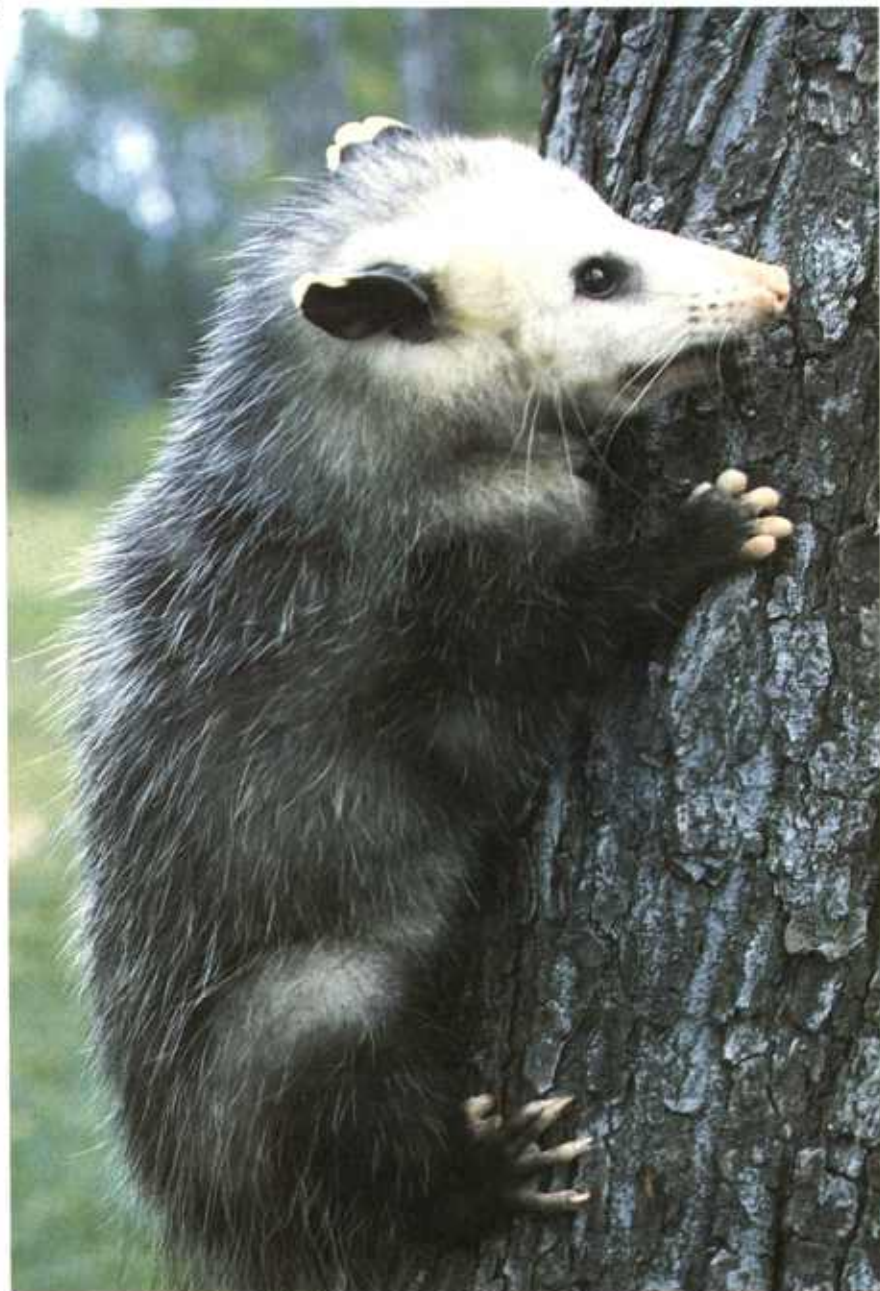
Figure 27.—Opossum eating larva.