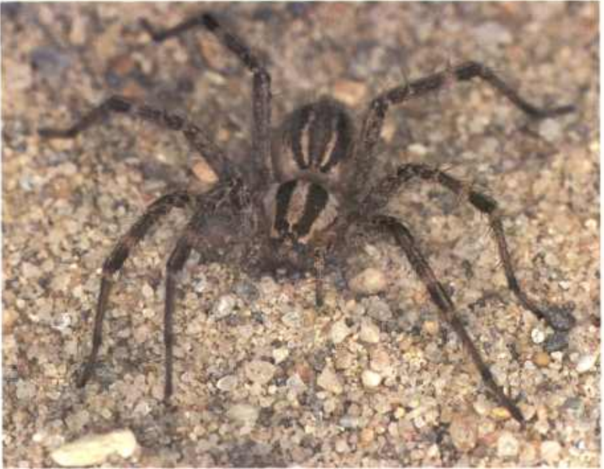
Figure 40.—Wolf spider.

Spiders live everywhere and eat almost any living invertebrate provided it can be overpowered. Spiders are known to be beneficial because they destroy a large number of insects, but they are rarely mentioned as predators of forest pest insects. Forbush and Fernald (1896) listed 11 species of spiders from six families that they had seen attacking gypsy moth eggs, larvae, pupae, or adults.