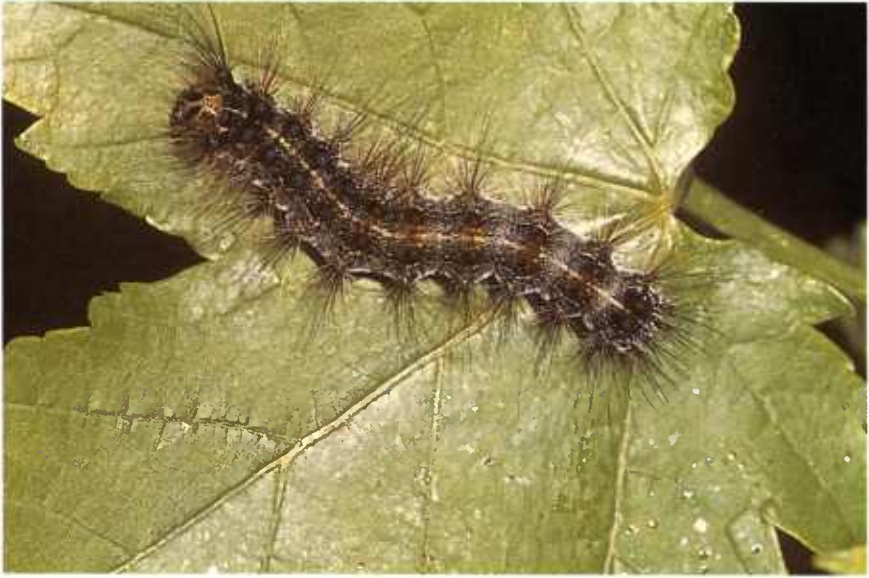
Figure 1.—Gypsy moth larva.