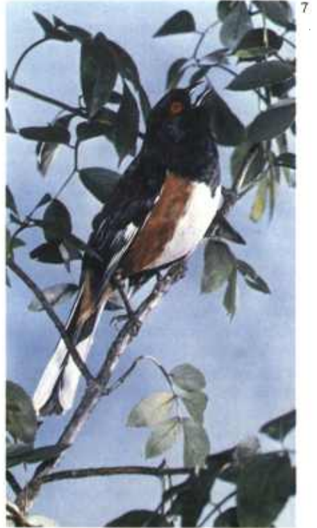
Figure 7.—Rufous-sided towhee.

The towhee (fig. 7) is an important predator of the gypsy moth because of its willingness to eat late-stage larvae and adult moths. The towhee is also important because of its large size (about 40 g) and the high population densities it often reaches—up to two adults per hectare in most early successional forests where there is a large amount of brush cover near the ground. Under ideal conditions the species may reach densities of two to three times that of other bird species in the same area. Towhees normally raise two broods of four to six young per brood per year. Towhees feed mainly on the ground but search for and capture gypsy moths in sparse gypsy moth populations whenever the gypsy moths migrate to the litter. By consistently consuming late-stage larvae, pupae, and adults, the towhee assists in maintaining sparse gypsy moth populations.