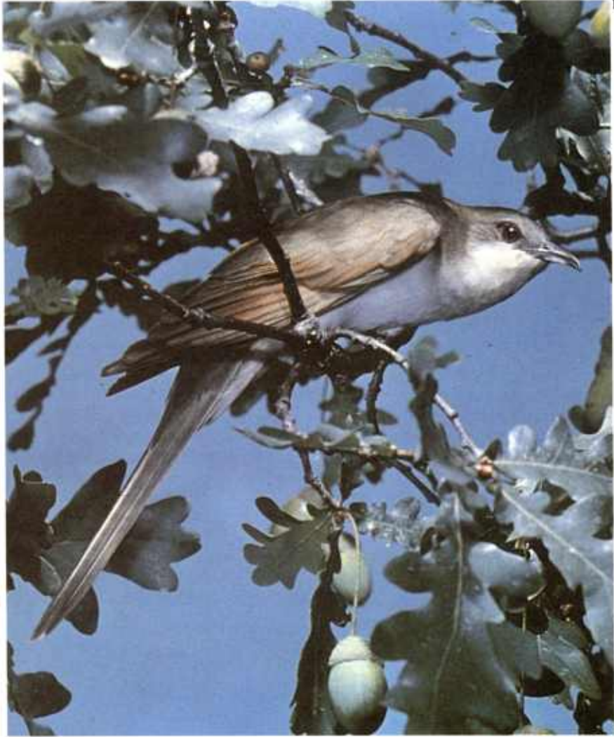
Figure 11.—Black-billed cuckoo.