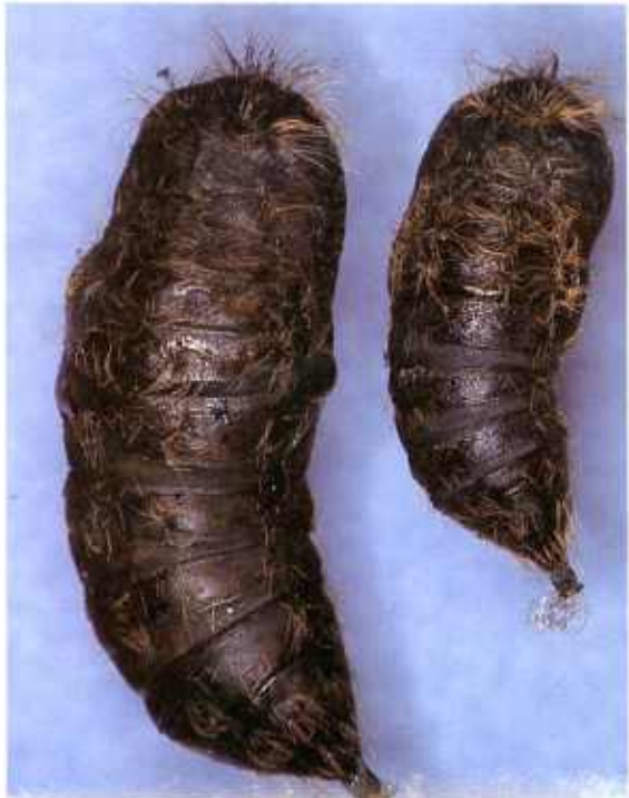
Figure 3.—Gypsy moth female adult with egg mass.