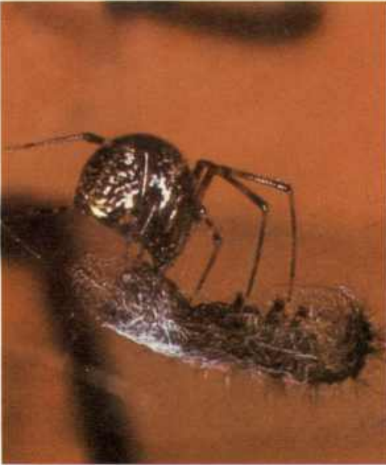
Figure 42.—Theridid spider with larva caught in web.

Spiders that construct cobwebs are often successful in trapping gypsy moth larvae and occasionally adults. The theridid spider in figure 42 has captured a gypsy moth larva in its web. Theridids build loose and irregular-shaped webs between leaves and branches of low trees and bushes.