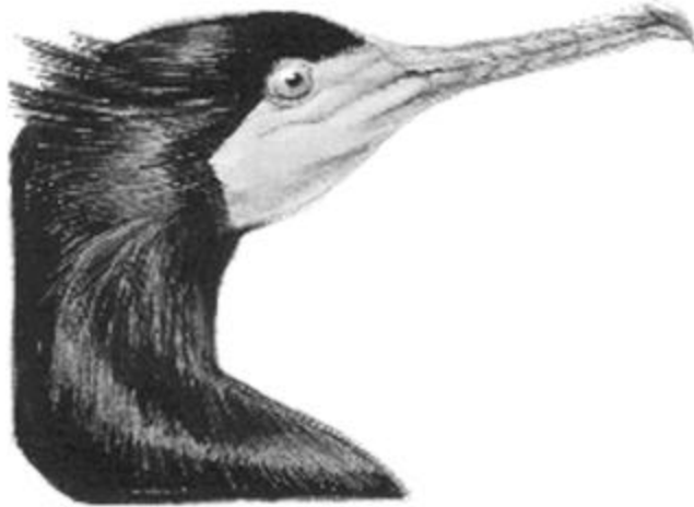
Phalacrocorax auritus Double-Crested Cormorant

Cormorants are found throughout the northern United States and Canada. In the winter they are found along the coasts and along rivers and lakes in the central northern states and in east Texas and Louisiana.