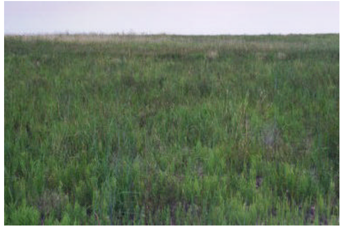
Native grasses and sand sage provide ideal lesser prairie-chicken nesting cover.

Nesting and brood-rearing cover for lesser prairie-chicken consists of grassland dominated by sand bluestem, sand dropseed, side oats grama, and little bluestem, interspersed with sand sagebrush, sand plum, skunkbush sumac, and shinners oak shrubs. Dense tall grasses growing in clumps, or mottes, varying from 3 to 10 feet in diameter are best for nesting lesser prairie-chickens; thick stands of even-growth vegetation do not. Females scratch shallow, bowl-shaped depressions in the soil and line them with dried grasses, leaves, and feathers to serve as nests. Ideal nesting habitat consists of an interspersion of 65 percent grassy mottes, 20 to 30 percent shrubs, and 5 to 15 percent forbs, with grasses and shrubs averaging at least 20 inches in height. Present-day range conditions rarely meet these conditions, however. Rangelands with taller grass species in good range condition can still be valuable to lesser prairie-chickens with a lesser shrub component. Tall grass in good condition is more important for nesting cover than the condition of the shrub component. Nesting sites are frequently established on north or northeast facing slopes to reduce exposure to southwest winds and direct sunlight, and are usually located one to two miles from the nearest lek.