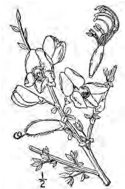
Figure 2. A sketch of Scotch broom stem, leaves, flower and seed pod. Britton, N.L., and A. Brown. 1913. An illustrated flora of the northern United States, Canada and the British Possessions . Vol. 2: 350.