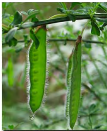
Figure 4. Scotch broom seed pods (Photo courtesy of Victorian Resources Online, 2010).

The flowers are arranged in terminal racemes or may be solitary in the leaf axils. They are bright yellow, but may be tinged with red or purple, and are approximately 3/4-inch (2 centimeters) in length. Flowers of Scotch broom are typical of those in the pea family, with five petals; two wings, two keels, and a banner or standard (see Figure 3). The wings are oblong to ovate in shape. The keel petals of Scotch broom are typically fused to form one structure, which contains both the pollen and seed producing flower parts. The flowers have a slender, strongly curved style, which is longer than the keel. Scotch broom flowers have ten stamens, five long stamens above the ovary and five short stamens below.