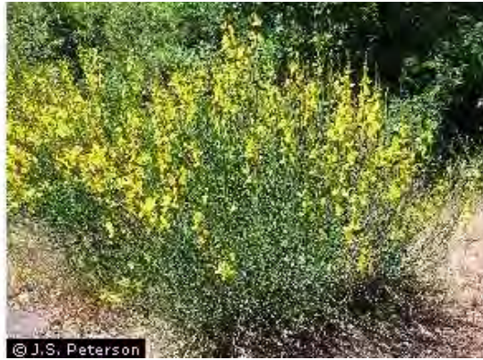
Figure 1. Scotch broom colony (Photo courtesy of J.S. Peterson, USDA Plants Database, 2009).

Jim Jacobs, Invasive Species Specialist, NRCS, Bozeman, Montana