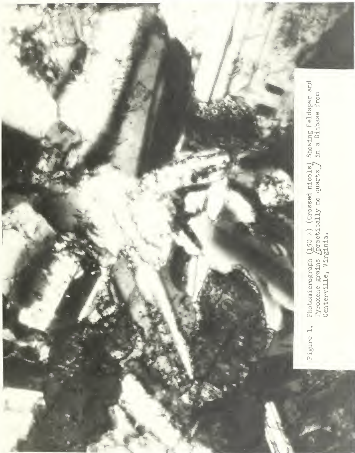
Figure 1. Photomicrograph (150 X) (Crossed nicols) Showing Feldspar and Pyroxene grains [practically no quartz] in a Diabase from Centerville, Virginia.