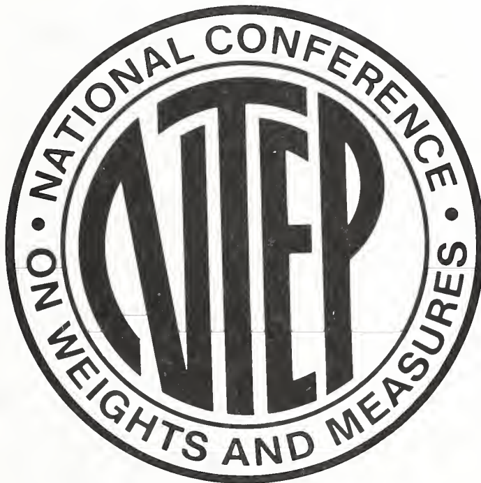
Figure 2 - NTEP Logo

The NTEP Logo (see below) may be used in conjunction with the above statements as well as alone in materials dealing with the NTEP.