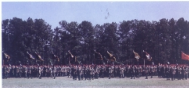
Figure 6. Assignments

c. Quartermaster jobs and units are located throughout the Continental United States and many overseas areas, providing Quartermaster officers with ample opportunity for travel.