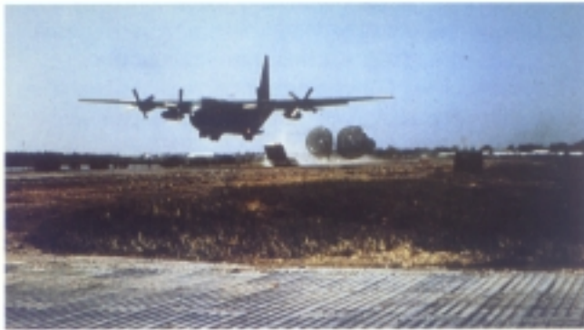
Figure 3. Description of the Quartermaster Corps—Continued