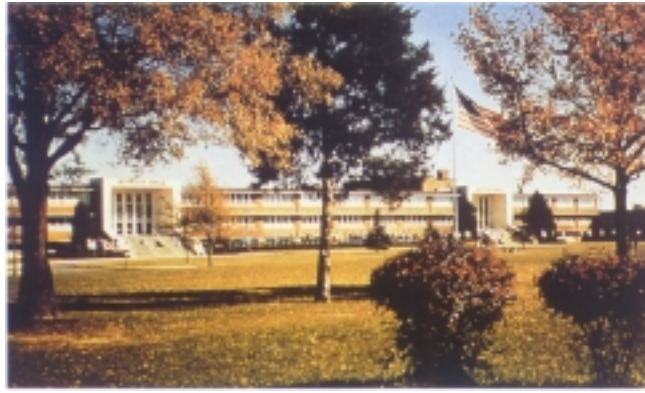
Figure 19. Fort Lee, Virginia (Home of the Quartermaster School)