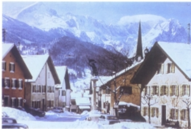
Figure 13. Where Can I Serve

Quartermaster Officers can be found virtually everywhere. The close relationship that exists between the functions performed by these officers and direct support to the Army in the field places Quartermaster officers in each of the Army's combat divisions, corps, and installations both in CONUS and overseas. Assignments in national level logistics will bring officers into contact with civilian industries and communities from which the national inventory control points and depots obtain their materiel commodities and draw their manpower. Senior staff assignments, on the other hand, will place officers in the highest levels of the national defense establishment. Although the main concentrations of Quartermaster officers are in CONUS, Hawaii, Alaska, Germany, and Korea, others can be found in interesting places like Italy, Great Britain, Saudi Arabia, Egypt, Belgium, Australia, Japan, and Panama.