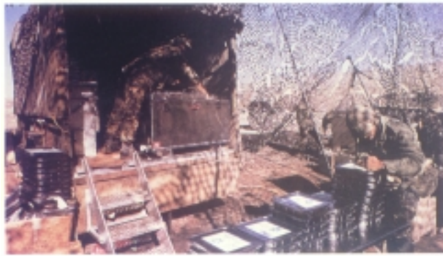
Figure 5. Description of the Quartermaster Corps—Continued