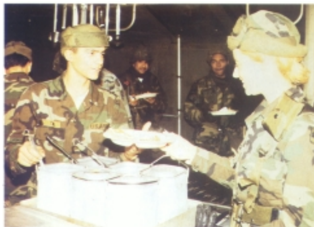
Figure 9. Professional Development—Continued