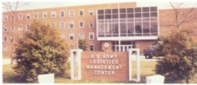
Figure 12. Schooling—Continued

b. Advanced Civil Schooling. Graduate degrees in various areas of Logistics and Industrial Management, Petroleum Engineering, Food Technology, and Business Administration are available on a competitive basis to selected officers, normally after completion of the advanced course and successful company command.