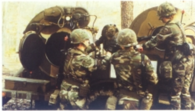
Figure 2. Description of the Quartermaster Corps