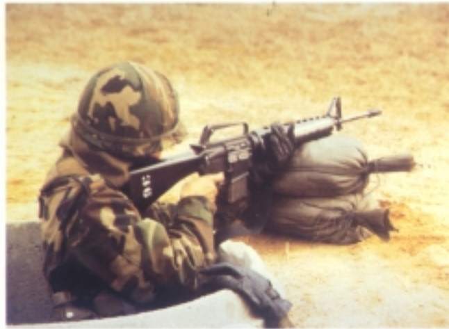
Figure 10. The Quartermaster Officer Basic Course

b. Following the QMOBC, selected officers will be given the opportunity to attend other professionally challenging schools such as the Airborne and Ranger courses taught at Ft. Benning, Georgia. Other officers may attend the Aerial Delivery and Materiel Officer course (Parachute Rigger) to prepare them for their initial duty assignment.