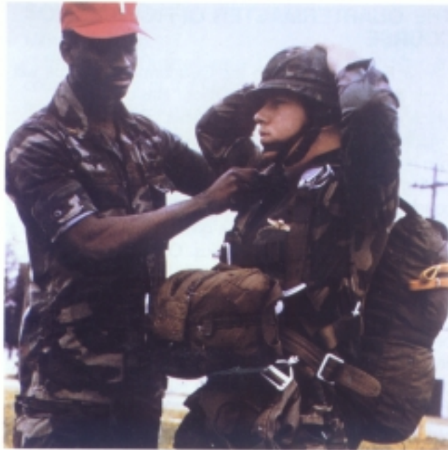
Figure 8. Professional Development

e. Some specific company grade professional development objectives for officers in the Quartermaster Corps include: a Baccalaureate degree, completion of the Officer Basic and Advanced Courses, completion of the Combined Arms and Services Staff School (CAS3) and successful duty performance in branch-related assignments. Company command is considered highly desirable for both promotion and professional development. Overall, an officer must become technically proficient and master essential troop leadership skills. Additional information on officer professional development can be found in DA Pamphlet 600-3.