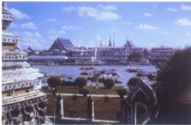
Figure 15. Where Can I Serve—Continued