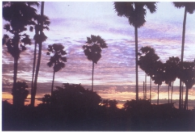
Figure 14. Where Can I Serve—Continued