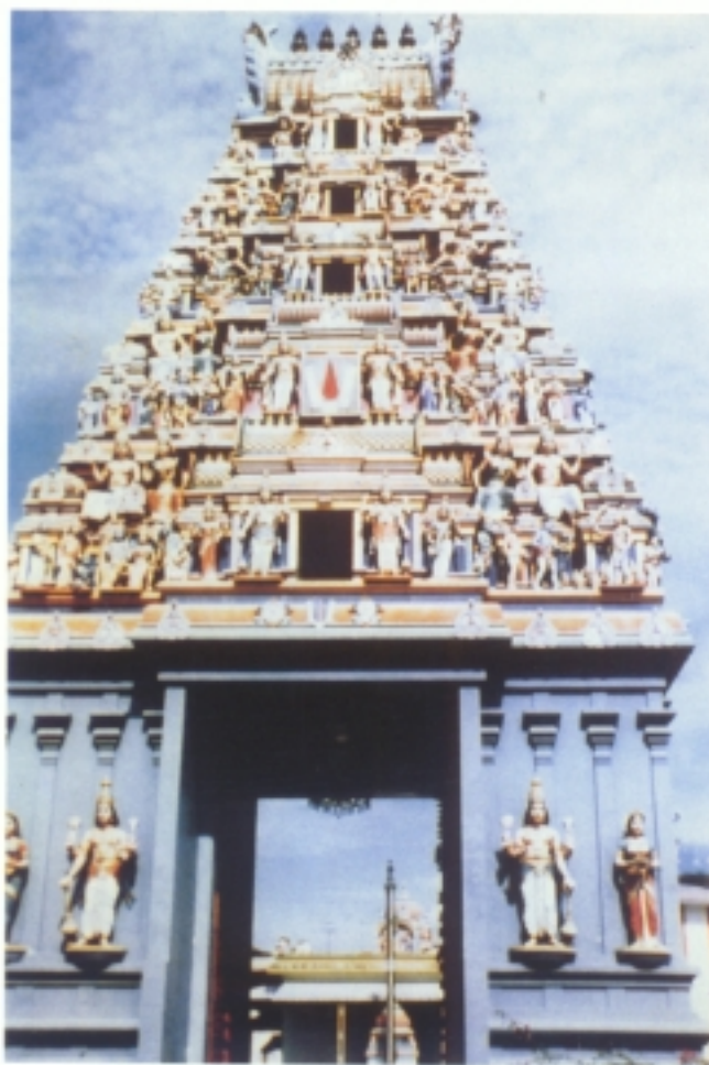
Figure 16. Where Can I Serve—Continued