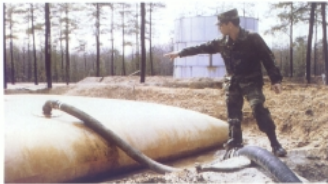
Figure 4. Description of the Quartermaster Corps—Continued