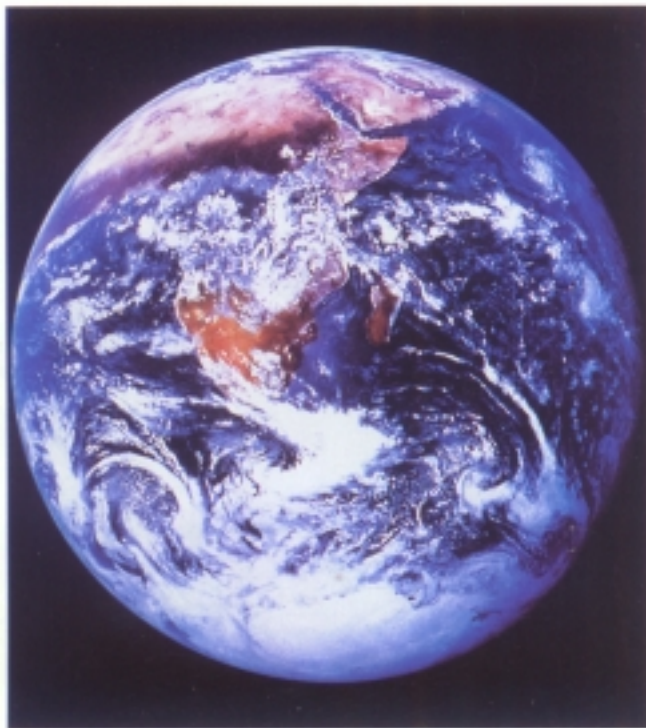
Figure 17. The Future