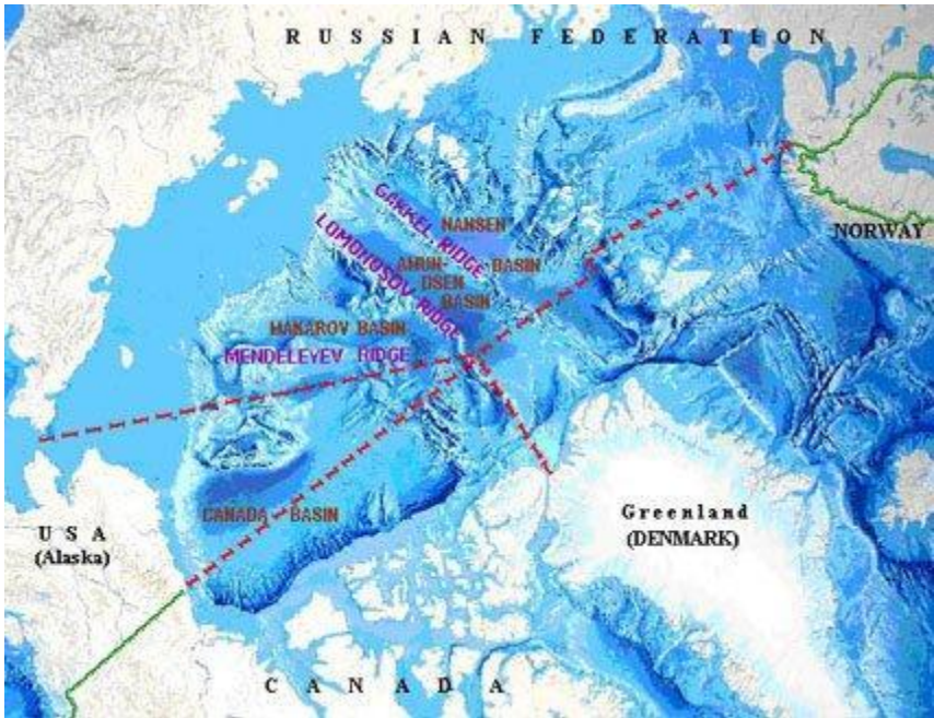
Figure One, from Yuri Morozov, “The Arctic: The Next ‘Hot Spot’ of International Relations or a Region of Cooperation?” The Carnegie Council, December 16 2009.