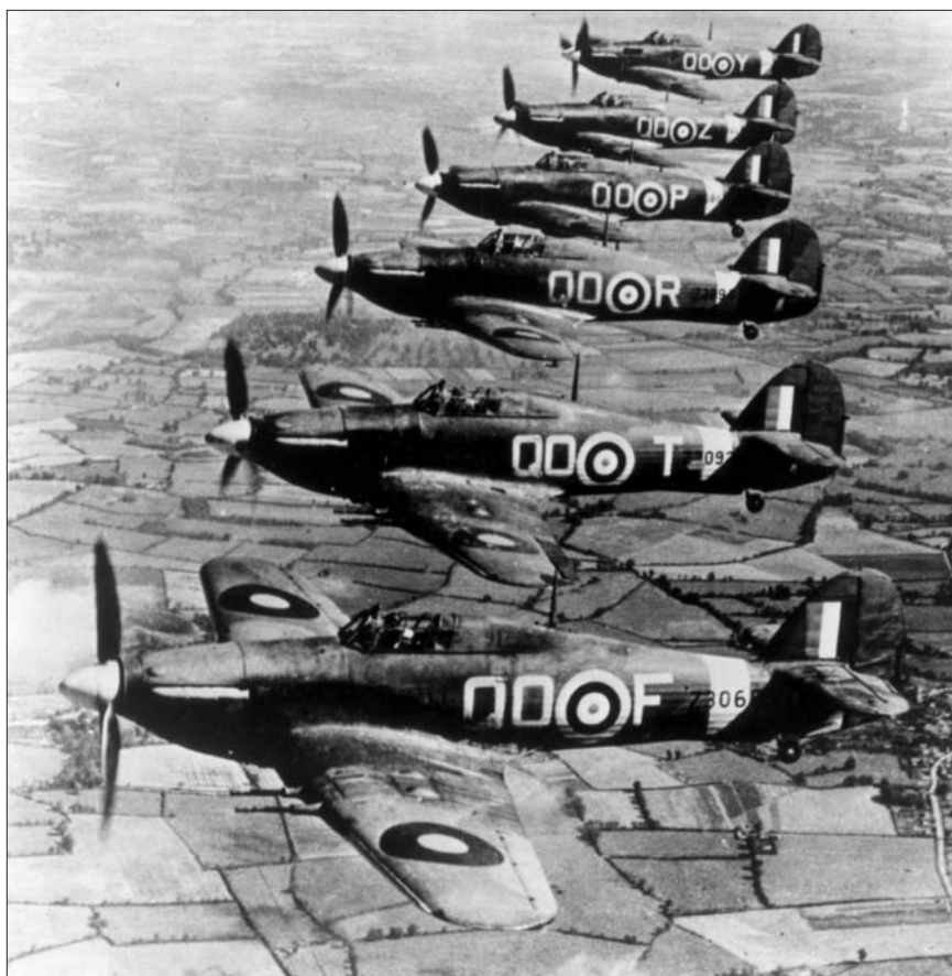
Hawker Hurricane II.