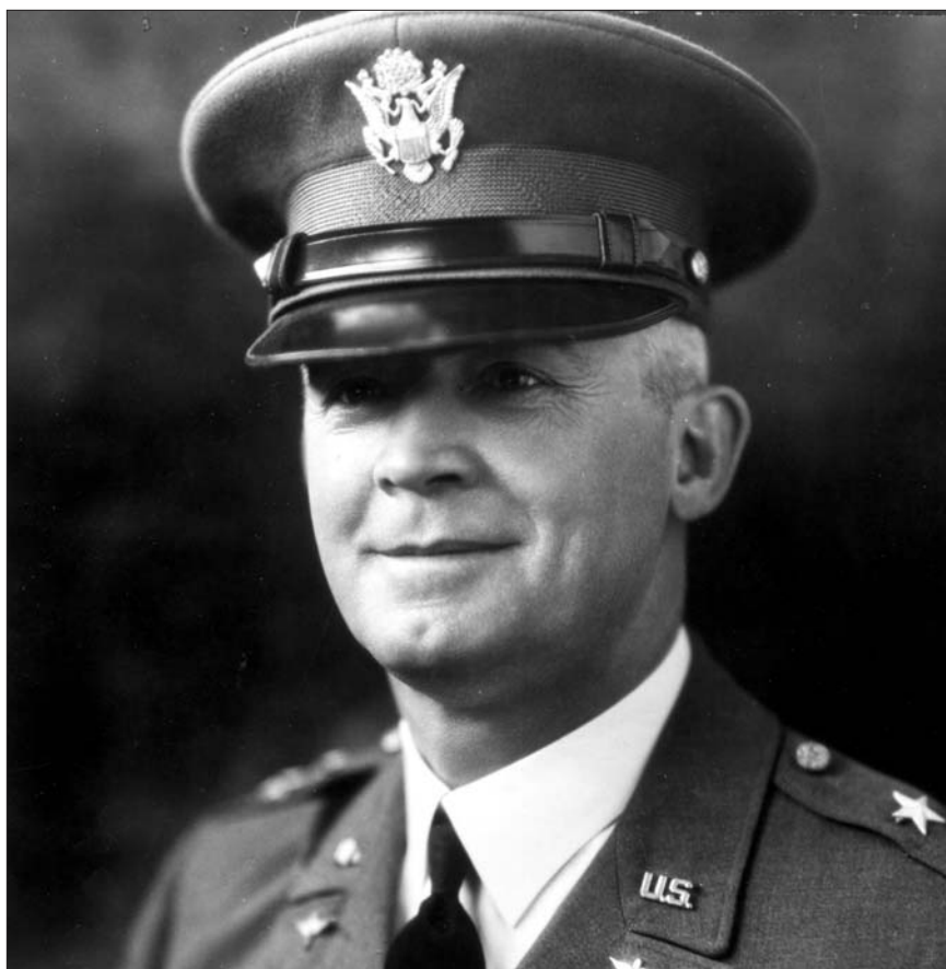
Maj. Gen. Henry H. "Hap" Arnold.

The American Eagle Squadron pilots did not have to wait long for their first taste of combat. After arriving at Martlesham Heath in April 1941, 71 Squadron pilots flew several missions including one off the French coast, south of Boulogne where they encountered German aircraft but did not record any aerial victories. On May 15, two Eagle Squadron pilots engaged in a dogfight with three Bf 109s over the English Channel and during this encounter, one Bf 109 was damaged near Calais. The Americans, however, did not escape unscathed: one Hurricane was damaged, due in part to being hit by fire from another American aircraft, and had to crash land.