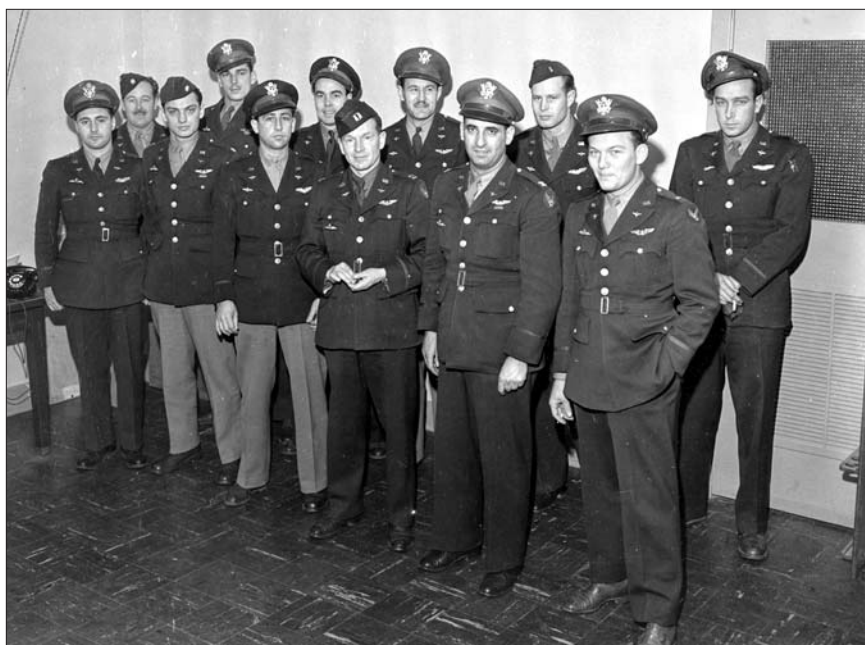
Group picture of former Eagle Squadron pilots in the USAAF.

as one of the youngest colonels in the USAAF and Blakeslee as commander of the Fourth Fighter Group.