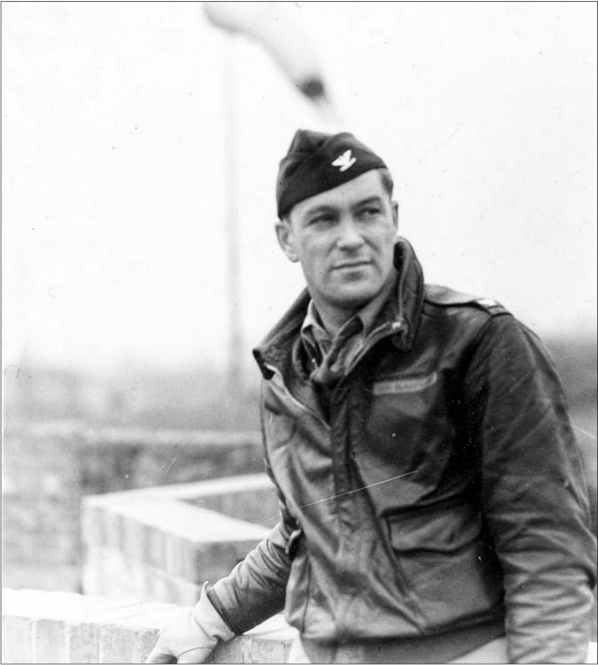
Col. Donald Blakeslee in US Army Air Forces.

American air units were becoming increasingly involved in the war in Europe at this time. On August 17, 1942, 12 B-17s of the 97th Bomb Group took part in the first heavy bomber attack from the United Kingdom when the aircraft attacked the Rouen-Sotteville, France, marshalling yards. The B-17s were escorted by RAF Spitfires included ones flown by 133 Squadron pilots. During the Dieppe Raid, the American 309th Fighter Squadron, 31st Fighter Group, provided air cover over the ground operations and 22 B-17s dropped 34 tons of bombs on the Abbeville/Drucat, France airfield in an attempt to draw German fighters away from the landing force.