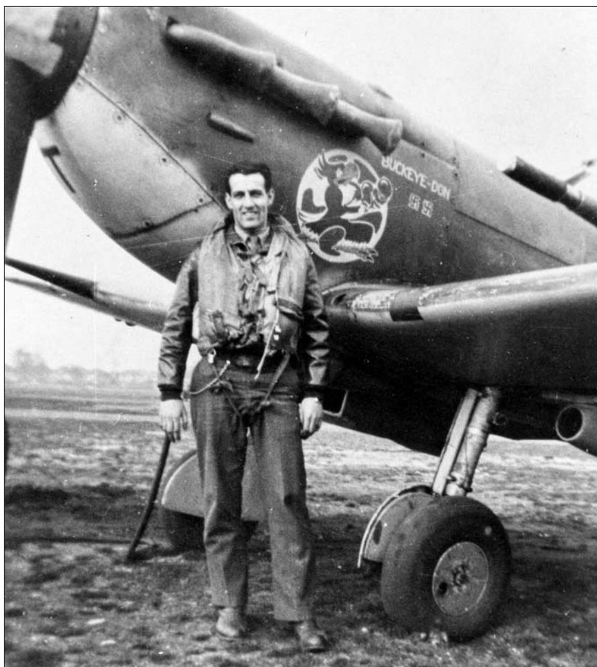
Dominic "Don" Gentile in front of his Spitfire Mark VB.

lets. The New York Times , Washington Post , and Time magazine published many stories, especially when squadron members received British decorations for gallantry in combat. Another venue occurred through the medium of motion pictures. In July 1942, the American-made movie, Eagle Squadron , received its premiere showing in London. Members of 71 Squadron were not involved in the actual production of the film but believed it would be a documentary style film. This belief was reinforced by the fact that movie crews had filmed scenes of the unit at North Weald. As the case turned out, the film which featured Robert Stack, Diana Barrymore, John Hall, Eddie Albert and Nigel Bruce, turned out after a brief introduction by the respected journalist Quentin Reynolds to be a typical Hollywood fictionalized war story. Most of the Eagles who attended the premier