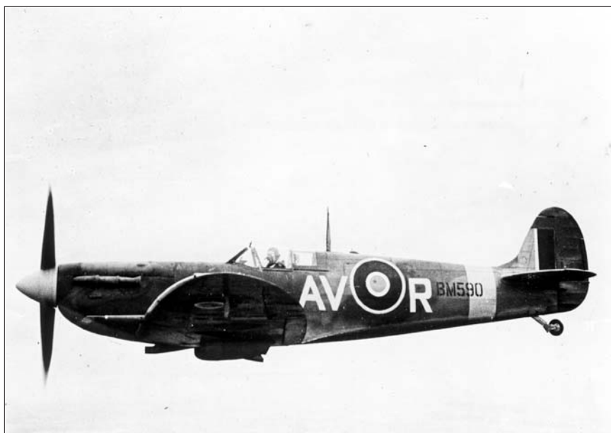
Supermarine Spitfire Mark VB.

tion; 121 Squadron moved to North Weald and 133 Squadron transferred to Kirton-in-Lindsey.