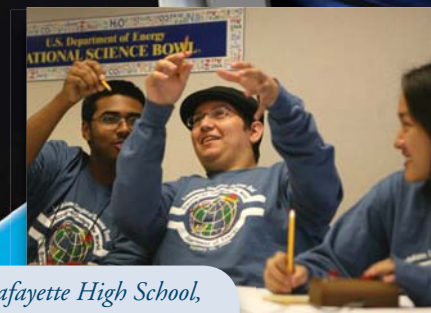
Lafayette High School, Lafayette, LA makes a point or two or three...