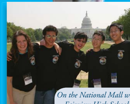
On the National Mall with Fairview High School, Boulder, CO