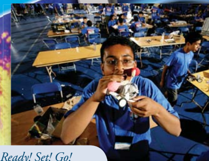
Ready! Set! Go! Building Hydrogen Fuel Cell Cars