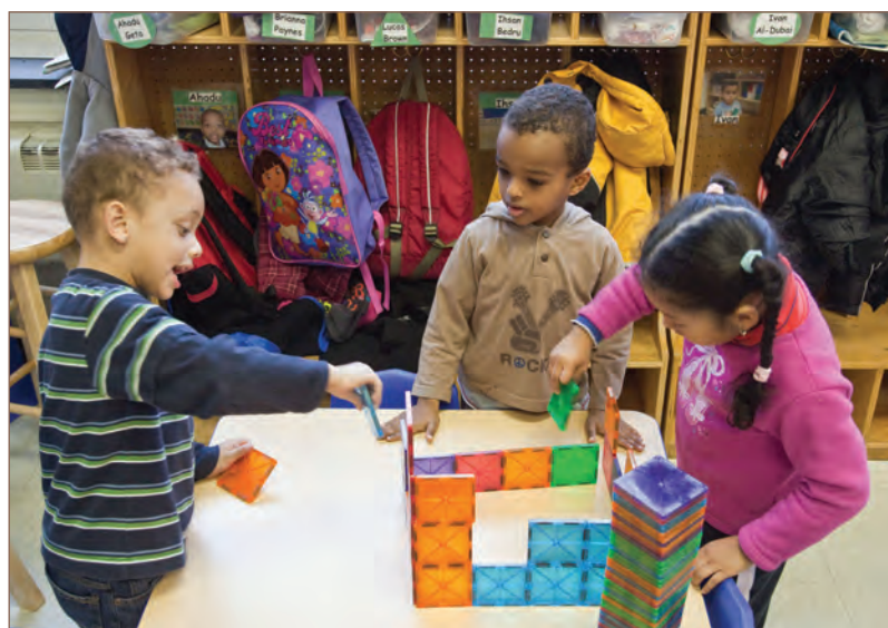
During play, preschoolers manage their actions, words, and behavior with increasing independence.