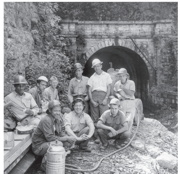
The National Park Service conducted repairs to the tunnel in 1956, 1979, and 2007. Above, craftsmen repairing the tunnel take a lunch break.

The tunnel was badly deteriorated. The National Park Service made major repairs to the tunnel, including replacing fallen bricks, filling cavities along the towpath, stabilizing rock slides, and repairing the façade of the downstream portal. Maintenance work continues to allow safe passage for today's hikers and bikers.