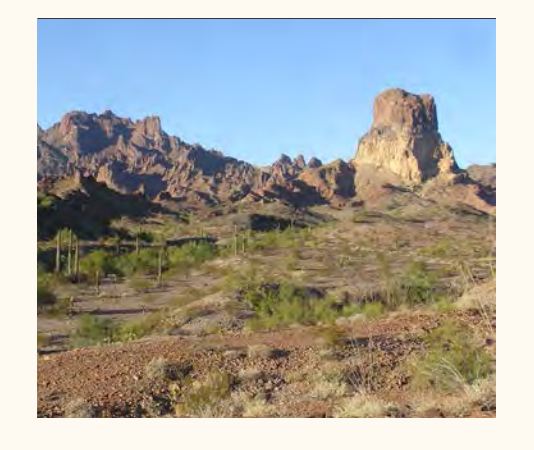
Top, Agave in bloom. Middle, Desert Tortoise. Bottom, Thumb Butte.