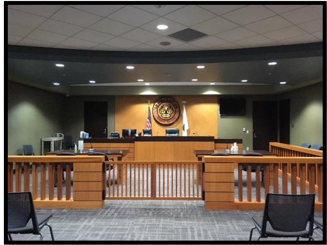
Lummi Nation Tribal Court, 2017

The first Wellness Courts were designed to serve either adult or juvenile participants in a criminal context. Later, Family Wellness Courts were developed to target parents with substance use disorders with a civil child welfare case. In a 2010 Wellness Court Needs Assessment, 7 which included twenty-eight operational Wellness Courts, respondents stated a need to work with whole families and household residents.