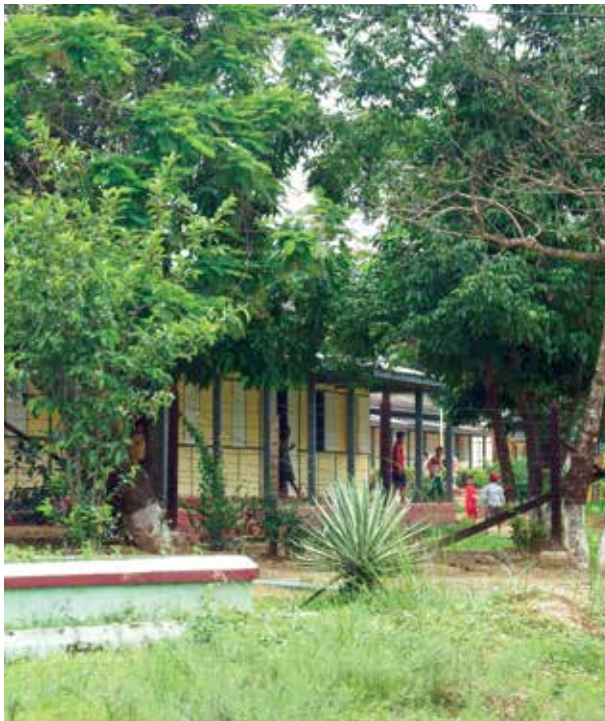
Na Ta La school, Khamti.

Buddhist worship. Buddhist literature and culture are taught on Saturdays, and on Sundays children are taught “Union Spirit,” which is essentially pro-military propaganda and includes singing nationalistic songs. Initiation into the monkhood or nunhood for a period every year is compulsory.