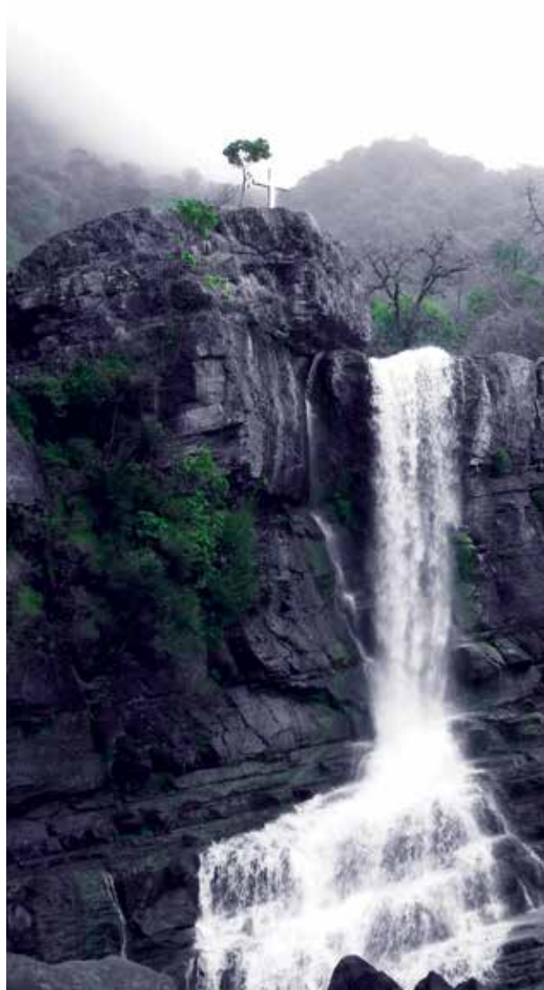
Cross, Matupi.

In Matupi in southern Chin State, an umbrella organization of churches applied for permission in 2012 to plant a cross on a mountain peak to replace one previously destroyed by the military, but did not receive a response. In 2013, locals planted a cross at a nearby waterfall to replace another cross destroyed by the military. Based on their earlier experience, they did not seek prior permission.