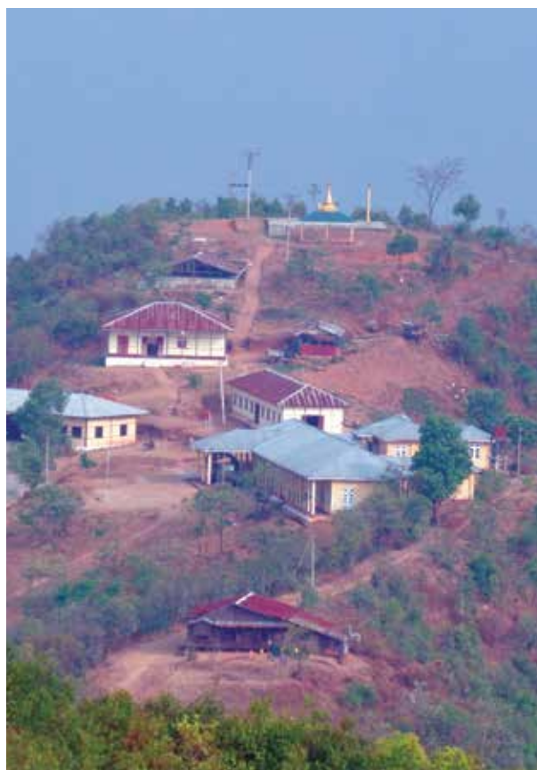
Military occupation, Matupi.

Under the Ministry of Religious Affairs, the regime introduced discriminatory restrictions on building Christian infrastructure and a mechanism for state spending on Buddhist infrastructure through the Department for the Promotion and Propagation of the Sasana. From the early 1990s onward, the military increased its occupation of predominantly Christian Chin, Kachin, and Naga areas, destroying churches and crosses while simultaneously expanding Buddhist infrastructure such as monasteries and pagodas, at times with the use of forced labor exacted from Christians. The regime dispatched monks loyal to military rule to monasteries in Chin, Kachin, and Naga areas via the Hill Regions Buddhist Mission under the Department for the Promotion and Propagation of the Sasana.