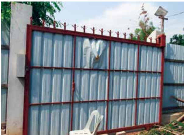
Damaged compound, Yesagyo.