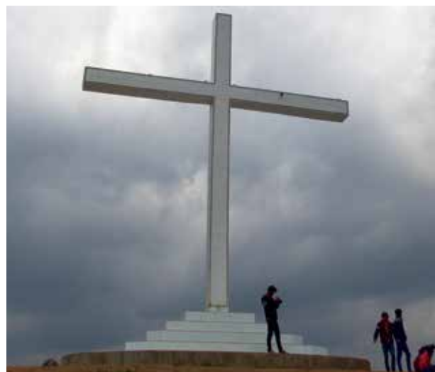
Calvary cross, Hakha.