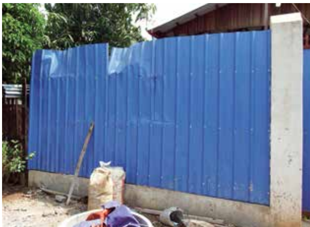
Damaged compound, Yesagyo.

Angered by the authorities’ apparent failure to take legal action against the pastor, Ma Ba Tha incited local Buddhists to stone the building and destroy property on three occasions, most recently in June 2015, for several days in a row. The pastor reported the attacks to the