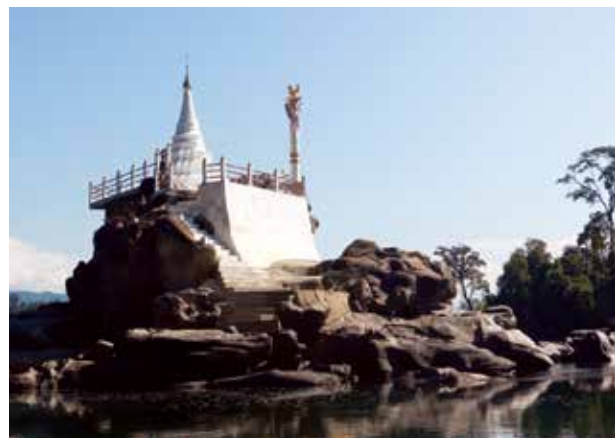
Nat Jawng.