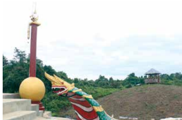
Machyang Baw site.

In the Naga area, local people in Tamanthi complained that the government is currently spending millions of kyats (Burma’s currency) on building monasteries in