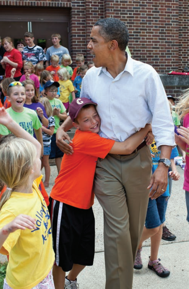
Left: Strolling with children from the Valleyland Kids summer program outside a school in Chatfield, MN, August 15.